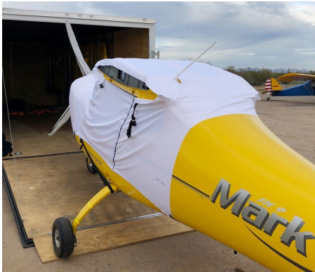
FK-Lightplanes FK-9 Canopy Cover, test fit cover