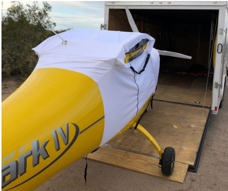
FK-Lightplanes FK-9 Canopy Cover, test fit cover

This cover type is made from Silver Acrylic Sunbrella canvas and is 100% lined with a soft and smooth microfiber. Bruce's Custom Covers developed this material combination especially for aircraft protection. The outer material is medium weight and treated for water resistance, UV resistance and anti-static buildup. The inner lining is a very soft and smooth microfiber to prevent scratching. The material is very reflective, and tests show that the cabin interior temperature can be reduced to near-ambient temperature on the hottest of days. It is water, ice and snow repellent, yet breathable to allow moisture to escape from between the cover and the aircraft surface.