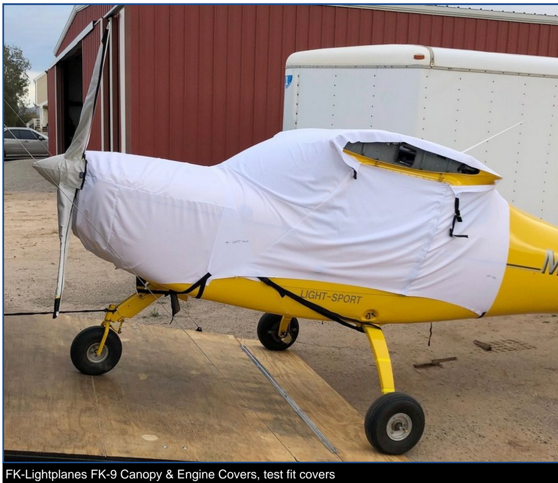
FK-Lightplanes FK-9 Canopy &amp; Engine Covers, test fit covers