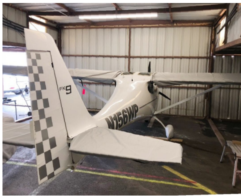
FK 9 MARK IV Wing & Horizontal Stabilizer Dust Covers