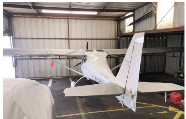
FK 9 MARK IV Wing & Horizontal Stabilizer Dust Covers