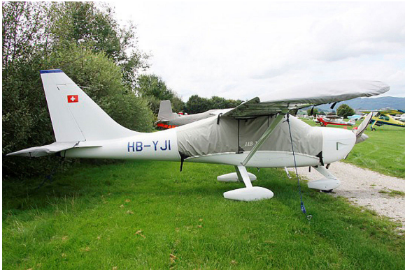
Glastar Canopy, Wings, Horizontal Stab. & Prop Covers

This cover type is made from Silver Acrylic Sunbrella canvas and is 100% lined with a soft and smooth microfiber. Bruce's Custom Covers developed this material combination especially for aircraft protection. The outer material is medium weight and treated for water resistance, UV resistance and anti-static buildup. The inner lining is a very soft and smooth microfiber to prevent scratching. The material is very reflective, and tests show that the cabin interior temperature can be reduced to near-ambient temperature on the hottest of days. It is water, ice and snow repellent, yet breathable to allow moisture to escape from between the cover and the aircraft surface.