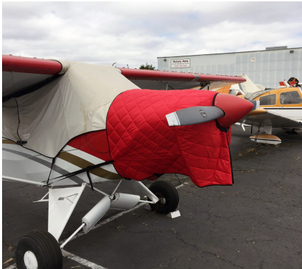
FOR INTERIOR USE. Cub Crafters CC-11 Insulated Hangar Blanket, available in Red or Silver