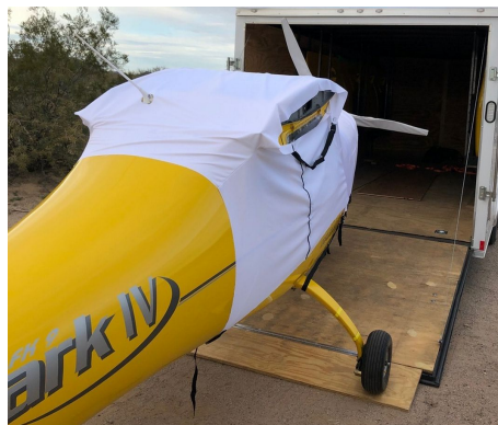
FK-Lightplanes FK-9 Canopy Cover, test fit cover