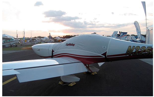
Arion Lightning Canopy Cover