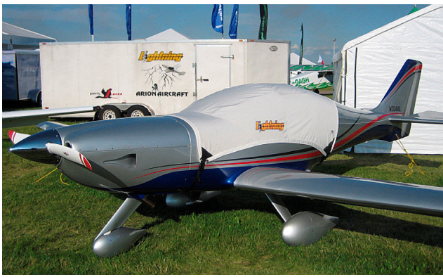
Lightning Canopy Cover