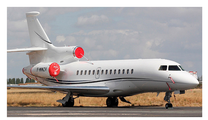
Falcon 7X Engine Covers (Outboard Engines & Center Exhaust)