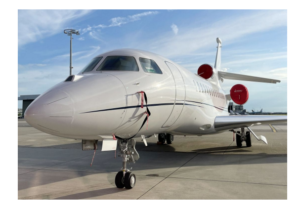
Falcon 7X Engine Cover Set, Pitot Covers

The Engine Inlet Plugs are custom fit for your Falcon Jet 7X intakes, made with heavy-duty vinyl material, and stuffed with a single block of sculpted urethane foam. Each plug has a zipper that allows the foam to be removed and dried if necessary. Engine plugs have 'remove before flight' streamers sewn onto the face of the plugs. Most plugs are imprinted with the aircraft registration number in black for an extra charge. Storage bag NOT included. Engine plugs may be inserted after flight when the engine is still warm. Engine Inlet Plugs are commonly referred to as Cowl Plugs, Intake Plugs, Cowl Blocks, Engine Blocks, and Engine Bungs.