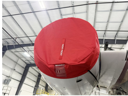
Dassault Falcon 6X Intake/Exhaust Covers (set of 4)