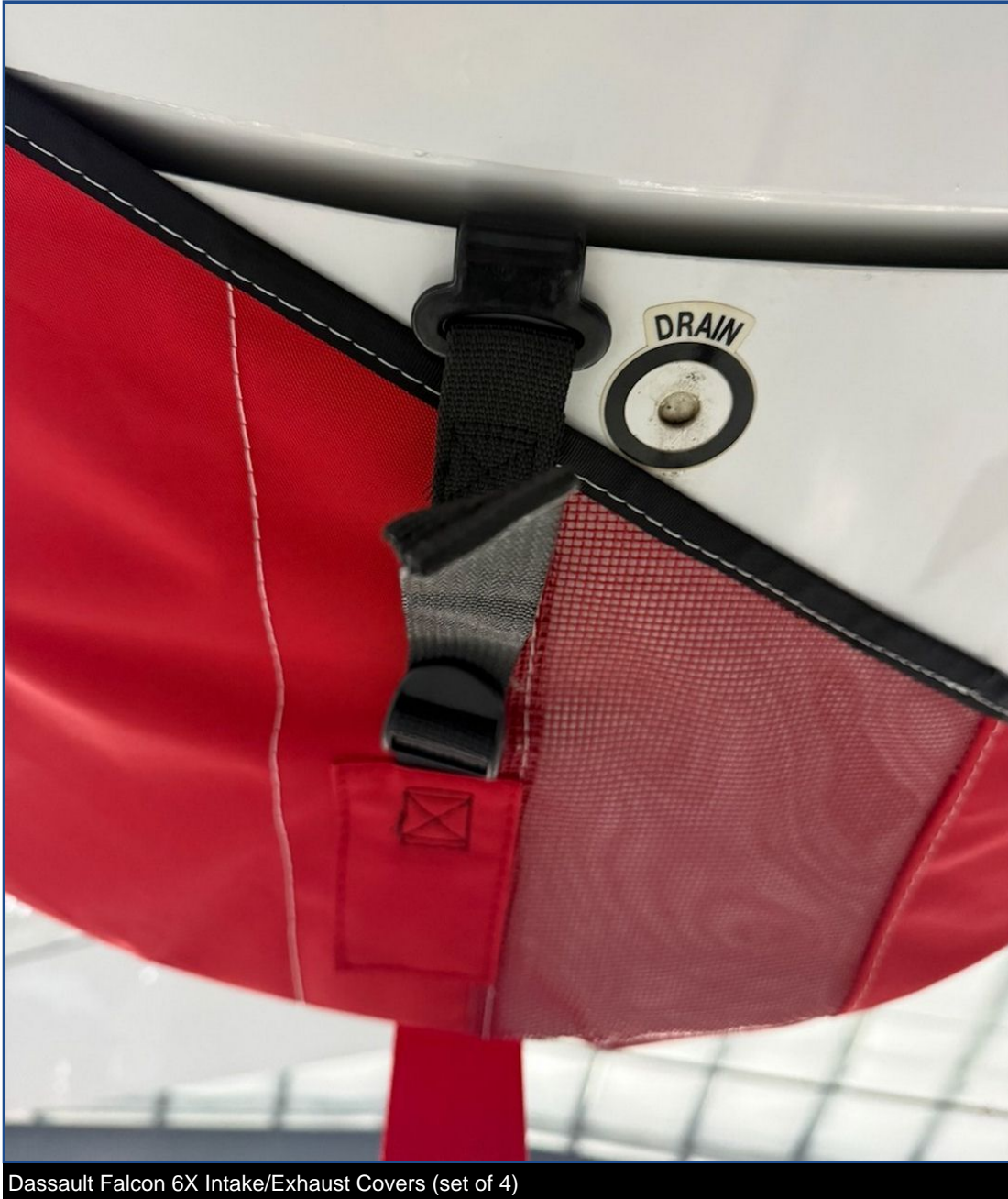
Dassault Falcon 6X Intake/Exhaust Covers (set of 4)