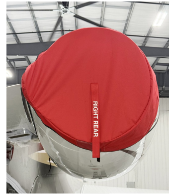
Dassault Falcon 6X Intake/Exhaust Covers (set of 4)