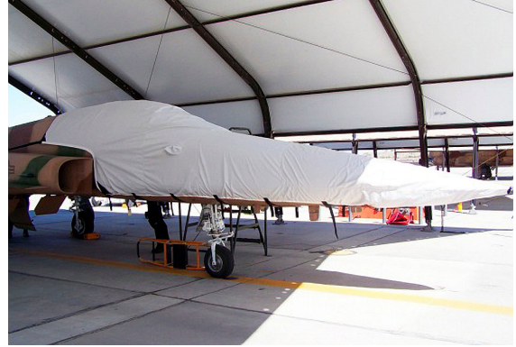
Northrup F-5 Talon Canopy/Nose Cover