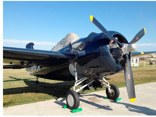
Grumman F4F Wildcat Canopy Cover