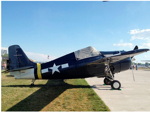
Grumman F4F Wildcat Canopy Cover