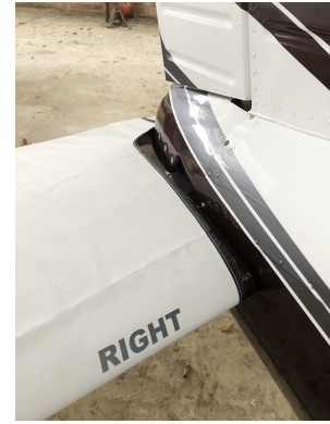
Piper PA-28 Horizontal Stabilizer Cover