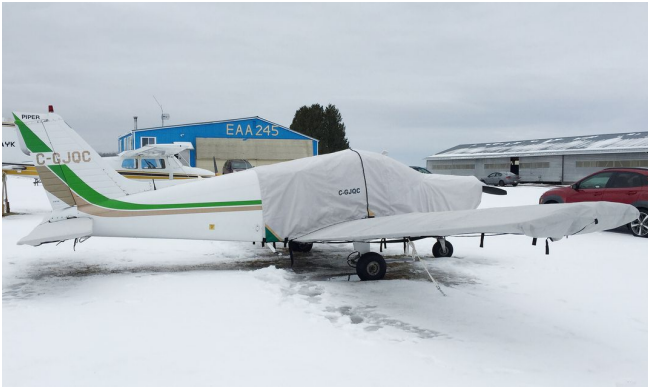
Piper PA-28 Extended Canopy/Engine, Wing & Horizontal Stabilizer Covers

mitigation, or for occasional travel. The material is lighter and more compact, but more susceptible to UV damage and may have a shorter useful life if used continuously outside than the all-year use material.