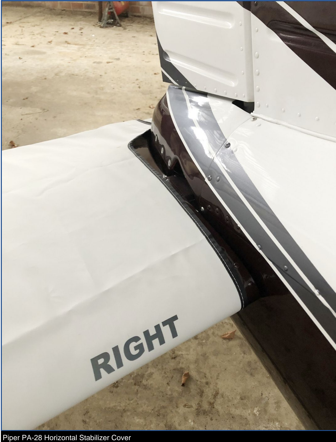
Piper PA-28 Horizontal Stabilizer Cover