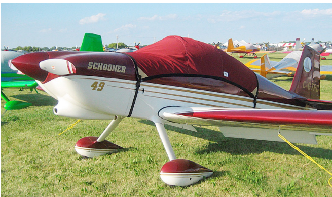
F1 Rocket Canopy Cover

This cover type is made from Silver Acrylic Sunbrella canvas and is 100% lined with a soft and smooth microfiber. Bruce's Custom Covers developed this material combination especially for aircraft protection. The outer material is medium weight and treated for water resistance, UV resistance and anti-static buildup. The inner lining is a very soft and smooth microfiber to prevent scratching. The material is very reflective, and tests show that the cabin interior temperature can be reduced to near-ambient temperature on the hottest of days. It is water, ice and snow repellent, yet breathable to allow moisture to escape from between the cover and the aircraft surface.