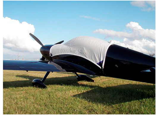
Harmon Rocket Canopy Cover