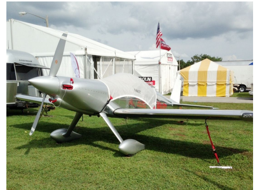
F1 Rocket Canopy Cover, Engine Plugs