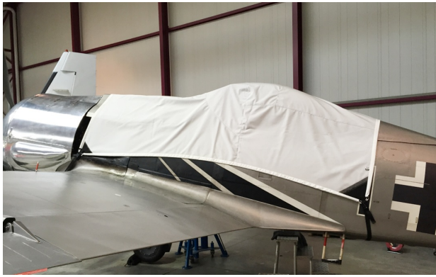
Focke Wulf 190 Canopy Cover