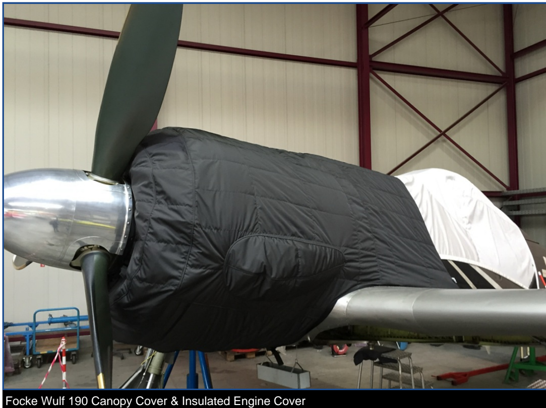
Focke Wulf 190 Canopy Cover &amp; Insulated Engine Cover