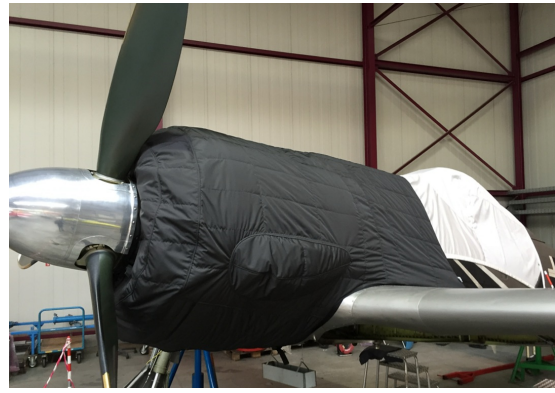
Focke Wulf 190 Canopy Cover & Insulated Engine Cover