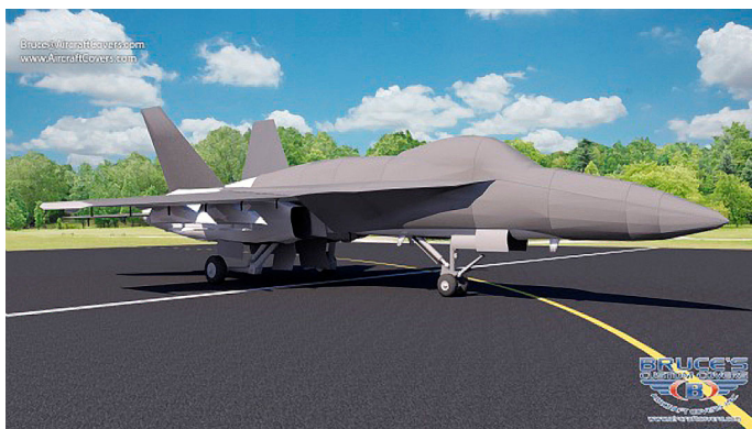
F-18 Storage Covers, 3D rendering