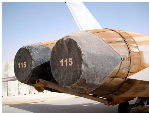
F-18 Exhaust Covers