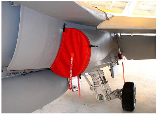
F-18 Engine Inlet Cover