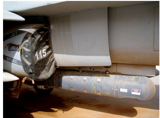
F-18 Intake Covers