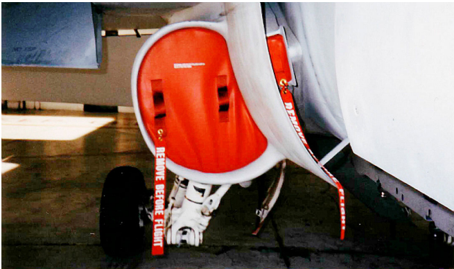
Engine & ECS Inlet Plugs