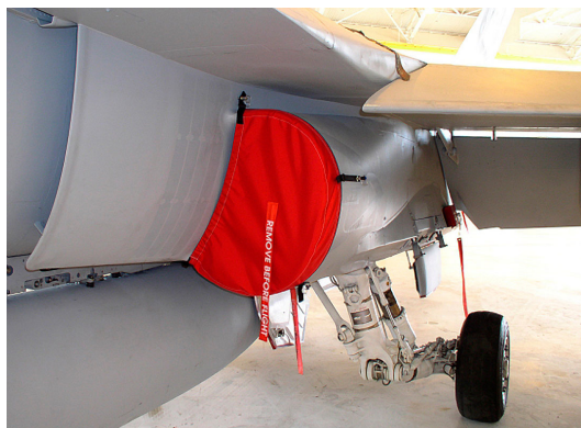
F-18 Engine Inlet Cover

The McDonnell Douglas F-18 Hornet, Super Hornet Intake Covers are designed to install easily yet be completely storable. A spring steel hoop is sewn into the hem of each cover, allowing them to be installed without climbing onto the wing or using a stepladder. To store the covers the spring steel hoop folds like a band-saw blade into three nesting rings. Each cover folds into a compact circular bundle which is stored in the included duffle bag, yet they unfold quickly for use. The Tri-Fold Ring cover is made of medium weight nylon which is available in a variety of colors to match the paint trim. Each cover set comes complete with installation and folding instructions. The aircraft's registration number can be silkscreened onto the cover for an extra charge.