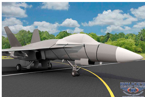
F-18 Canopy Cover, illustration