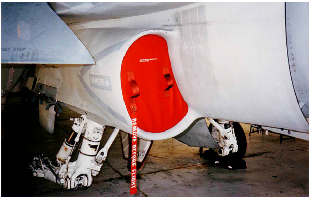
Engine Inlet Plug

The Engine Inlet Plugs are custom fit for your McDonnell Douglas F-18 Hornet, Super Hornet intakes, made with heavy-duty vinyl material, and stuffed with a single block of sculpted urethane foam. Each plug has a zipper that allows the foam to be removed and dried if necessary. Engine plugs have 'remove before flight' streamers sewn onto the face of the plugs. Most plugs are imprinted with the aircraft registration number in black for an extra charge. Storage bag NOT included. Engine plugs may be inserted after flight when the engine is still warm. Engine Inlet Plugs are commonly referred to as Cowl Plugs, Intake Plugs, Cowl Blocks, Engine Blocks, and Engine Bungs.