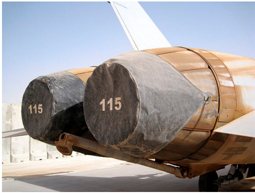
F-18 Exhaust Covers

The McDonnell Douglas F-18 Hornet, Super Hornet Intake Covers are designed to install easily yet be completely storable. A spring steel hoop is sewn into the hem of each cover, allowing them to be installed without climbing onto the wing or using a stepladder. To store the covers the spring steel hoop folds like a band-saw blade into three nesting rings. Each cover folds into a compact circular bundle which is stored in the included duffle bag, yet they unfold quickly for use. The Tri-Fold Ring cover is made of medium weight nylon which is available in a variety of colors to match the paint trim. Each cover set comes complete with installation and folding instructions. The aircraft's registration number can be silkscreened onto the cover for an extra charge.