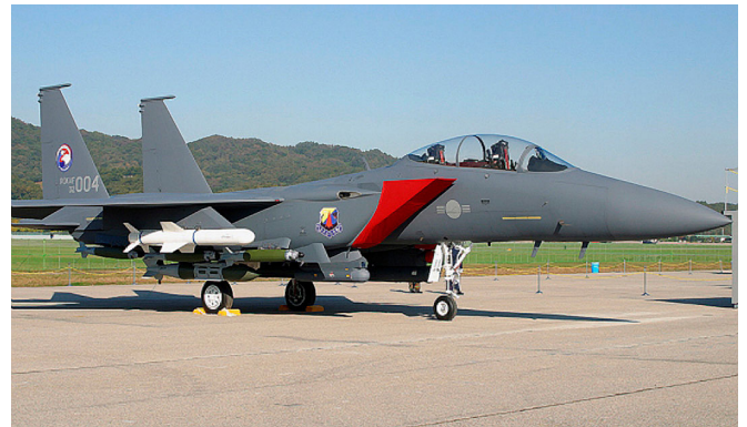
Intake Cover, F15-K