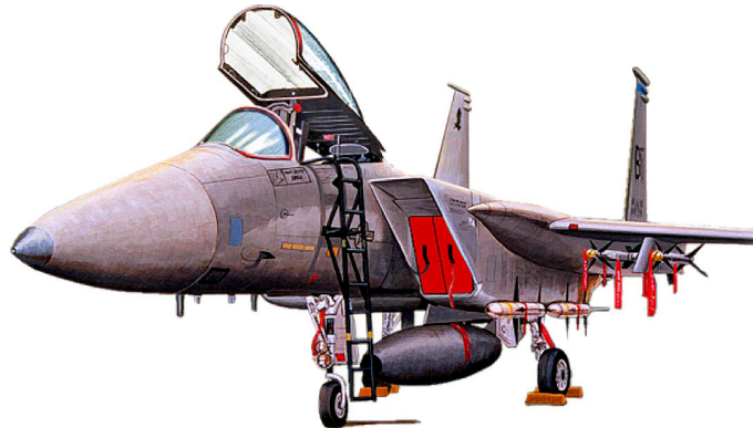
F15 Cockpit HeatShields & Intake Plugs