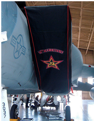
F15 Intake Cover