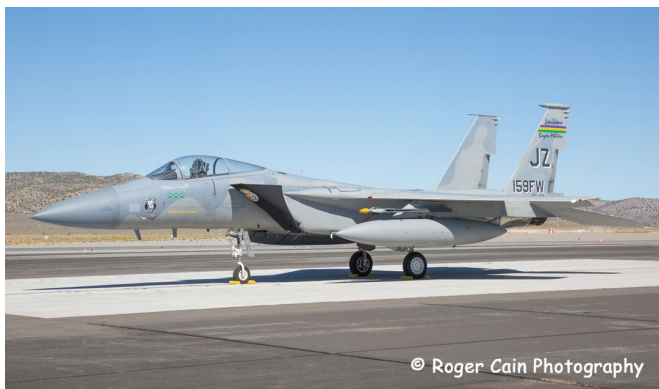
McDonnell-Douglas F-15 Intake Covers

The McDonnell Douglas F-15 Eagle Intake Covers are designed to install easily yet be completely storable. A spring steel hoop is sewn into the hem of each cover, allowing them to be installed without climbing onto the wing or using a stepladder. To store the covers the spring steel hoop folds like a band-saw blade into three nesting rings. Each cover folds into a compact circular bundle which is stored in the included duffle bag, yet they unfold quickly for use. The Tri-Fold Ring cover is made of medium weight nylon which is available in a variety of colors to match the paint trim. Each cover set comes complete with installation and folding instructions. The aircraft's registration number can be silkscreened onto the cover for an extra charge.