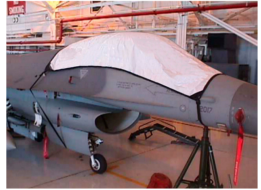
F-16 "Blackout" type Canopy Cover