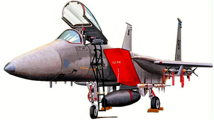
F15 Cockpit HeatShields & Inlet Cover