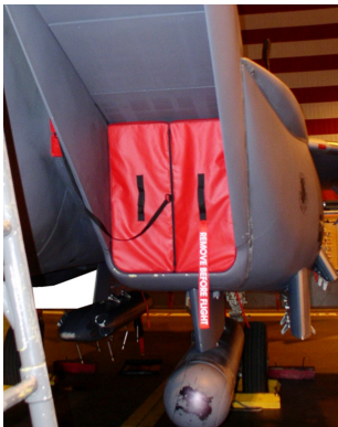
F15 Intake Plugs

The Engine Inlet Plugs are custom fit for your McDonnell Douglas F-15 Eagle intakes, made with heavy-duty vinyl material, and stuffed with a single block of sculpted urethane foam. Each plug has a zipper that allows the foam to be removed and dried if necessary. Engine plugs have 'remove before flight' streamers sewn onto the face of the plugs. Most plugs are imprinted with the aircraft registration number in black for an extra charge. Storage bag NOT included. Engine plugs may be inserted after flight when the engine is still warm. Engine Inlet Plugs are commonly referred to as Cowl Plugs, Intake Plugs, Cowl Blocks, Engine Blocks, and Engine Bungs.