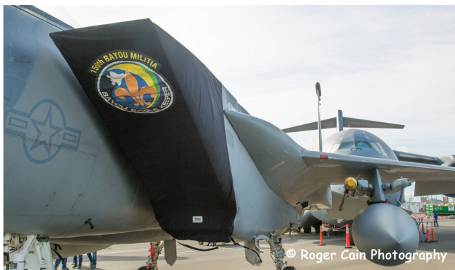
McDonnell-Douglas F-15 Intake Covers

The McDonnell Douglas F-15 Eagle Intake Covers are designed to install easily yet be completely storable. A spring steel hoop is sewn into the hem of each cover, allowing them to be installed without climbing onto the wing or using a stepladder. To store the covers the spring steel hoop folds like a band-saw blade into three nesting rings. Each cover folds into a compact circular bundle which is stored in the included duffle bag, yet they unfold quickly for use. The Tri-Fold Ring cover is made of medium weight nylon which is available in a variety of colors to match the paint trim. Each cover set comes complete with installation and folding instructions. The aircraft's registration number can be silkscreened onto the cover for an extra charge.