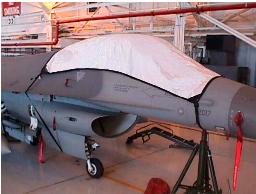
F-16 "Blackout" type Canopy Cover