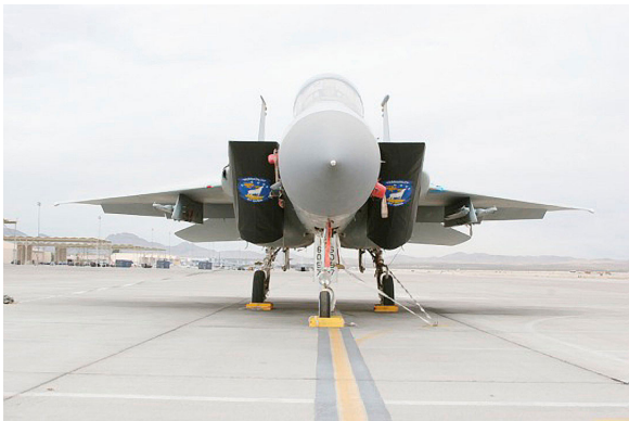
McDonnell-Douglas F-15 Intake Covers

The McDonnell Douglas F-15 Eagle Intake Covers are designed to install easily yet be completely storable. A spring steel hoop is sewn into the hem of each cover, allowing them to be installed without climbing onto the wing or using a stepladder. To store the covers the spring steel hoop folds like a band-saw blade into three nesting rings. Each cover folds into a compact circular bundle which is stored in the included duffle bag, yet they unfold quickly for use. The Tri-Fold Ring cover is made of medium weight nylon which is available in a variety of colors to match the paint trim. Each cover set comes complete with installation and folding instructions. The aircraft's registration number can be silkscreened onto the cover for an extra charge.