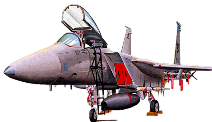
F15 Cockpit HeatShields & Intake Plugs

The Engine Inlet Plugs are custom fit for your McDonnell Douglas F-15 Eagle intakes, made with heavy-duty vinyl material, and stuffed with a single block of sculpted urethane foam. Each plug has a zipper that allows the foam to be removed and dried if necessary. Engine plugs have 'remove before flight' streamers sewn onto the face of the plugs. Most plugs are imprinted with the aircraft registration number in black for an extra charge. Storage bag NOT included. Engine plugs may be inserted after flight when the engine is still warm. Engine Inlet Plugs are commonly referred to as Cowl Plugs, Intake Plugs, Cowl Blocks, Engine Blocks, and Engine Bungs.