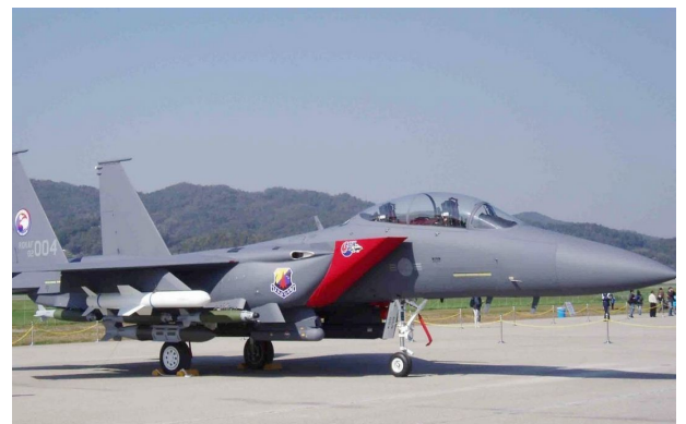
McDonnell Douglas F-15 Eagle Engine Inlet Covers