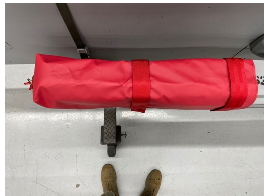
McDonnell Douglas F-15 Launcher Rail Cover