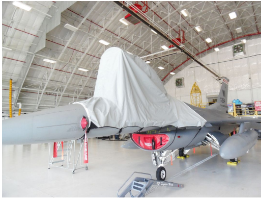
F-16 CANOPY COVER, OPEN POSITION (C-Model, single seat models)

Canopy Covers are commonly referred to as Cabin Covers, Fuselage Covers, Canvas Covers, Canopy Caps, etc.