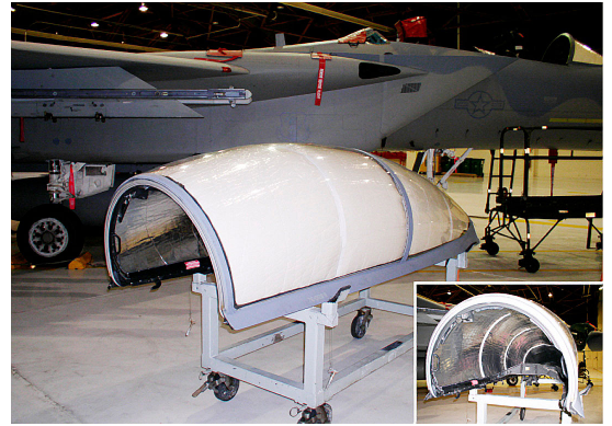
F-15 Cockpit HeatShield