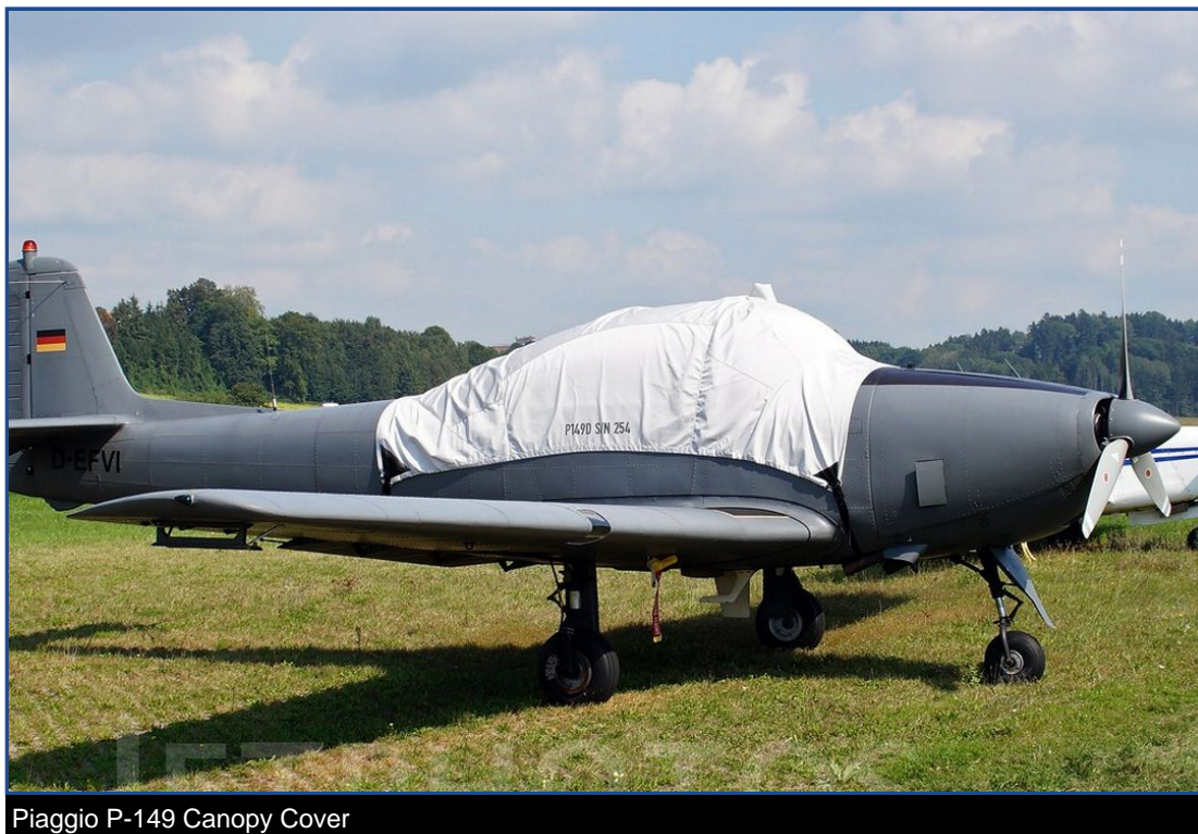
Piaggio P-149 Canopy Cover