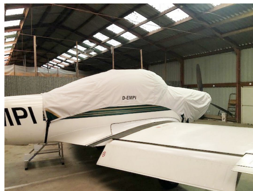
Piaggio FW-149D Canopy/Engine Cover