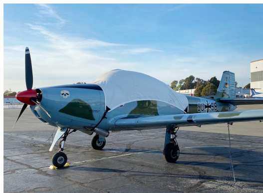
Focke Wulf 149 Trainer Canopy Cover

of the Canopy Cover and Engine Cover. This cover will enclose the engine cowl and will extend aft to cover all of the windows. This cover type is made from Silver Acrylic Sunbrella canvas and is 100% lined with a soft and smooth microfiber. Bruce's Custom Covers developed this material combination especially for aircraft protection. The outer material is medium weight and treated for water resistance, UV resistance and anti-static buildup. The inner lining is a very soft and smooth microfiber to prevent scratching. The material is very reflective, and tests show that the cabin interior temperature can be reduced to near-ambient temperature on the hottest of days. It is water, ice and snow repellent, yet breathable to allow moisture to escape from between the cover and the aircraft surface.