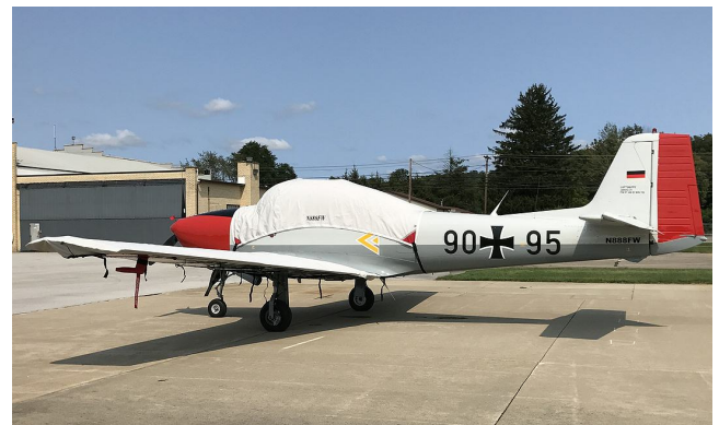
Focke Wulf F149 Canopy Cover, Wing Covers