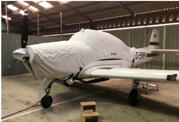
Piaggio FW-149D Canopy/Engine Cover