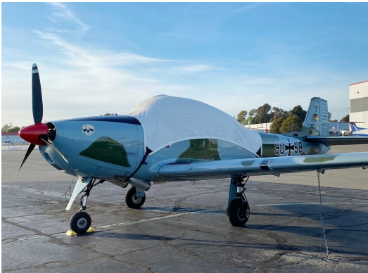
Focke Wulf 149 Trainer Canopy Cover

of the Canopy Cover and Engine Cover. This cover will enclose the engine cowl and will extend aft to cover all of the windows. This cover type is made from Silver Acrylic Sunbrella canvas and is 100% lined with a soft and smooth microfiber. Bruce's Custom Covers developed this material combination especially for aircraft protection. The outer material is medium weight and treated for water resistance, UV resistance and anti-static buildup. The inner lining is a very soft and smooth microfiber to prevent scratching. The material is very reflective, and tests show that the cabin interior temperature can be reduced to near-ambient temperature on the hottest of days. It is water, ice and snow repellent, yet breathable to allow moisture to escape from between the cover and the aircraft surface.