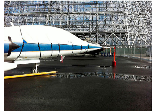
F-104 Tandem Canopy Cover