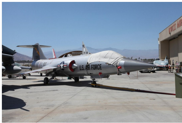
Lockheed F104 Canopy Cover, Intake Plugs