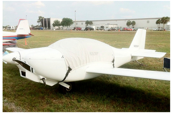
Europa XS Canopy Cover