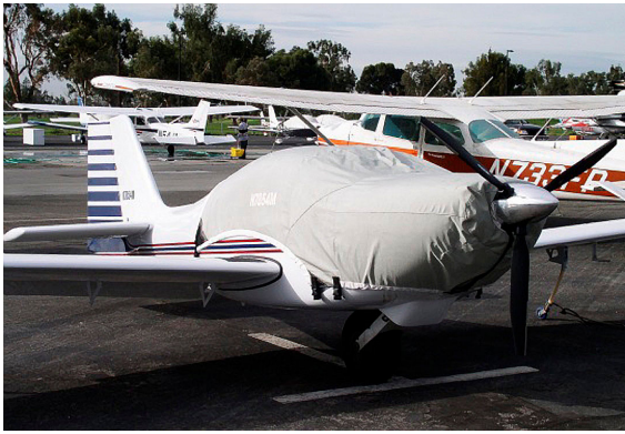
Europa Canopy/Engine Cover