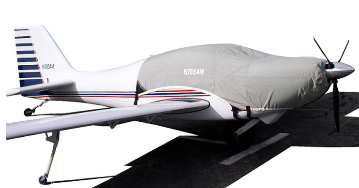
Europa Canopy/Engine Cover

The Europa All Europa Models Canopy/Engine Cover is a one-piece cover (100% lined with microfiber) that is a combination of the Canopy Cover and Engine Cover. This cover will enclose the engine cowl and will extend aft to cover all of the windows. This cover type is made from Silver Acrylic Sunbrella canvas and is 100% lined with a soft and smooth microfiber. Bruce's Custom Covers developed this material combination especially for aircraft protection. The outer material is medium weight and treated for water resistance, UV resistance and anti-static buildup. The inner lining is a very soft and smooth microfiber to prevent scratching. The material is very reflective, and tests show that the cabin interior temperature can be reduced to near-ambient temperature on the hottest of days. It is water, ice and snow repellent, yet breathable to allow moisture to escape from between the cover and the aircraft surface.