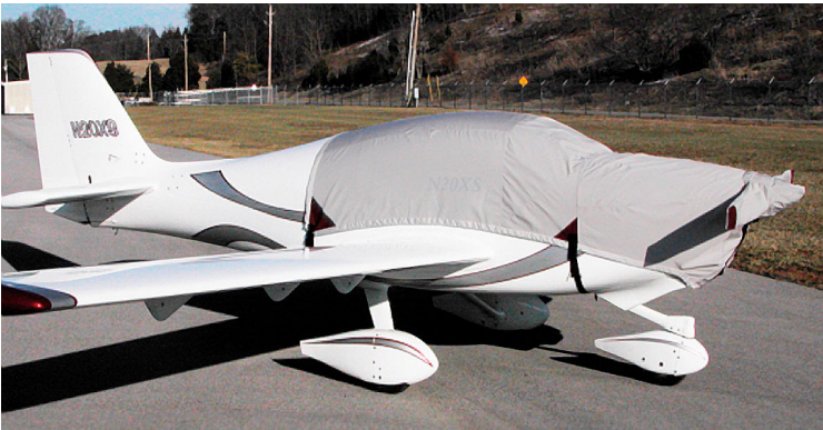
Canopy/Engine and Prop/Spinner Covers (tri-gear model)

This cover type is made from Silver Acrylic Sunbrella canvas and is 100% lined with a soft and smooth microfiber. Bruce's Custom Covers developed this material combination especially for aircraft protection. The outer material is medium weight and treated for water resistance, UV resistance and anti-static buildup. The inner lining is a very soft and smooth microfiber to prevent scratching. The material is very reflective, and tests show that the cabin interior temperature can be reduced to near-ambient temperature on the hottest of days. It is water, ice and snow repellent, yet breathable to allow moisture to escape from between the cover and the aircraft surface.