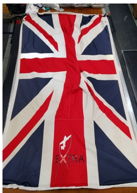
Custom Full-Cover Artwork

This cover type is made from Silver Acrylic Sunbrella canvas and is 100% lined with a soft and smooth microfiber. Bruce's Custom Covers developed this material combination especially for aircraft protection. The outer material is medium weight and treated for water resistance, UV resistance and anti-static buildup. The inner lining is a very soft and smooth microfiber to prevent scratching. The material is very reflective, and tests show that the cabin interior temperature can be reduced to near-ambient temperature on the hottest of days. It is water, ice and snow repellent, yet breathable to allow moisture to escape from between the cover and the aircraft surface.