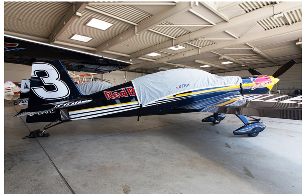
Extra 300L Canopy Cover