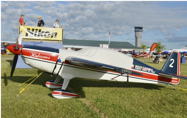
Extra 300 (mid-fuselage wing) Canopy Cover

This cover type is made from Silver Acrylic Sunbrella canvas and is 100% lined with a soft and smooth microfiber. Bruce's Custom Covers developed this material combination especially for aircraft protection. The outer material is medium weight and treated for water resistance, UV resistance and anti-static buildup. The inner lining is a very soft and smooth microfiber to prevent scratching. The material is very reflective, and tests show that the cabin interior temperature can be reduced to near-ambient temperature on the hottest of days. It is water, ice and snow repellent, yet breathable to allow moisture to escape from between the cover and the aircraft surface.