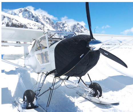
Kitfox Insulated Engine Cover

This cover type is made from Silver Acrylic Sunbrella canvas and is 100% lined with a soft and smooth microfiber. Bruce's Custom Covers developed this material combination especially for aircraft protection. The outer material is medium weight and treated for water resistance, UV resistance and anti-static buildup. The inner lining is a very soft and smooth microfiber to prevent scratching. The material is very reflective, and tests show that the cabin interior temperature can be reduced to near-ambient temperature on the hottest of days. It is water, ice and snow repellent, yet breathable to allow moisture to escape from between the cover and the aircraft surface.