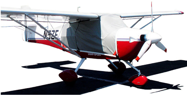
Aerotrek A240 Standard Canopy Cover

This cover type is made from Silver Acrylic Sunbrella canvas and is 100% lined with a soft and smooth microfiber. Bruce's Custom Covers developed this material combination especially for aircraft protection. The outer material is medium weight and treated for water resistance, UV resistance and anti-static buildup. The inner lining is a very soft and smooth microfiber to prevent scratching. The material is very reflective, and tests show that the cabin interior temperature can be reduced to near-ambient temperature on the hottest of days. It is water, ice and snow repellent, yet breathable to allow moisture to escape from between the cover and the aircraft surface.