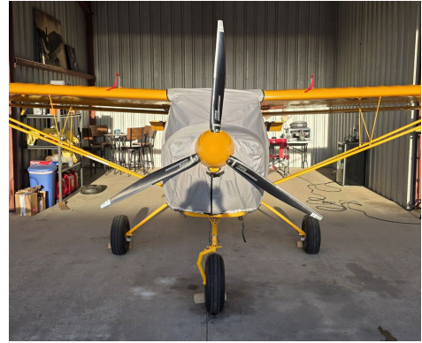
Aerotrek Eurofox Travel Canopy/Engine Cover