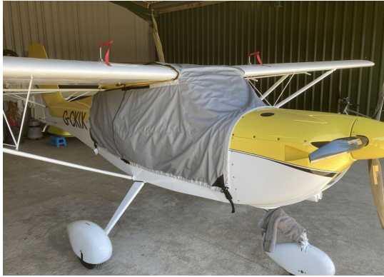
Eurofox Travel Canopy Cover

Travel Covers are made with Silver Solution-Dyed Polyester fabric and only lined over the windshield to save weight. The material is lightweight and more compact for easy stowage in the aircraft. The polyester material is water resistant, but only intended for occasional use outside. We also have an ultra lightweight material available for fitted hangar dust covers. For daily outdoor use, the non-travel Sunbrella Cover is the best choice.