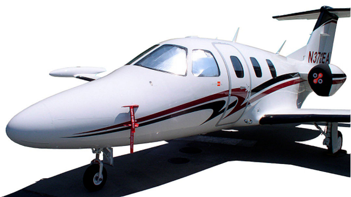
Cockpit HeatShields, Pitot Covers & "Bikini" style Engine Covers