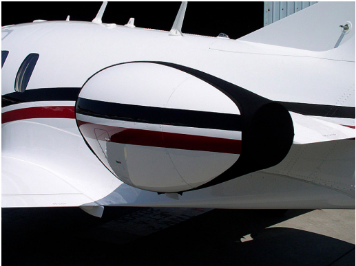
Bikini style Engine Covers