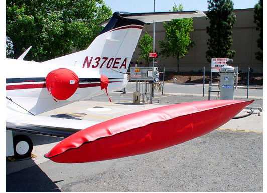
Eclipse Tip Tank & Engine Covers