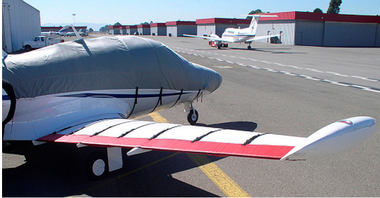
Fuselage Cover with Hail Protection & Wing Control Surfaces Hail Protection Pads

Designed to prevent damage to the aircraft extremities in crowded hangars, these products are made of bright red Naugahyde and thickly padded with a sandwich of closed cell foam.