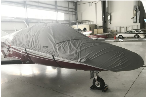
Eclipse EA550 Travel Canopy/Nose Cover

This cover type is made from Silver Acrylic Sunbrella canvas and is 100% lined with a soft and smooth microfiber. Bruce's Custom Covers developed this material combination especially for aircraft protection. The outer material is medium weight and treated for water resistance, UV resistance and anti-static buildup. The inner lining is a very soft and smooth microfiber to prevent scratching. The material is very reflective, and tests show that the cabin interior temperature can be reduced to near-ambient temperature on the hottest of days. It is water, ice and snow repellent, yet breathable to allow moisture to escape from between the cover and the aircraft surface.