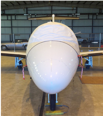
Eclipse Cockpit Door Cover, with Pitot Tube Covers