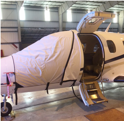
Eclipse Cockpit Door Cover, with Pitot Tube Covers

This cover type is made from Silver Acrylic Sunbrella canvas and is 100% lined with a soft and smooth microfiber. Bruce's Custom Covers developed this material combination especially for aircraft protection. The outer material is medium weight and treated for water resistance, UV resistance and anti-static buildup. The inner lining is a very soft and smooth microfiber to prevent scratching. The material is very reflective, and tests show that the cabin interior temperature can be reduced to near-ambient temperature on the hottest of days. It is water, ice and snow repellent, yet breathable to allow moisture to escape from between the cover and the aircraft surface.