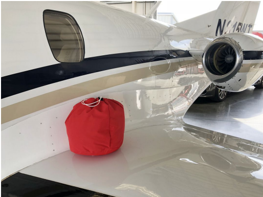
Eclipse EA500, TE500, 550 Travel Cover, Canopy/Nose Cover in Storage bag