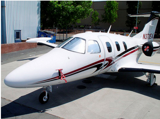
Eclipse Pitot Cover & Bikini Type Engine Covers