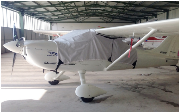
Glasair Aviation Glastar, Sportsman 2+2 Canopy Cover (Over-The-Top Style)