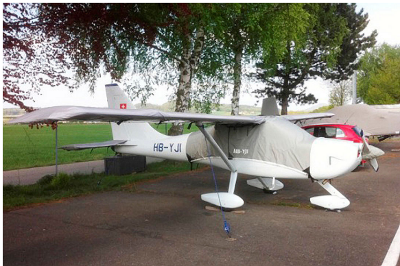
Glasair Aviation Glasair, Sportsman 2+2 Insulated Engine Cover OMF Symphony Canopy, Wings, Horiz. Stab, and Prop Covers