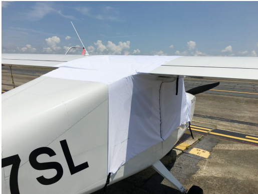
Vashon Ranger VR-7 Canopy Cover, test fit cover

Travel Covers are made with Silver Solution-Dyed Polyester fabric and only lined over the windshield to save weight. The material is lightweight and more compact for easy stowage in the aircraft. The polyester material is water resistant, but only intended for occasional use outside. We also have an ultra lightweight material available for fitted hangar dust covers. For daily outdoor use, the non-travel Sunbrella Cover is the best choice.