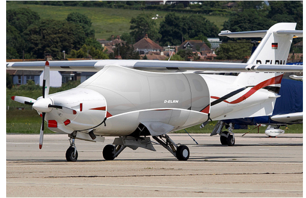
ENGINE PLUGS PREVENT BIRD NEST FOD. Piper Saratoga Engine Cowling Covers, Plugs & HeatShields for the Extra 400 Bird's Nest