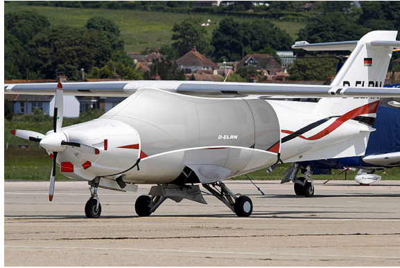
Covers, Plugs & HeatShields for the Extra 400