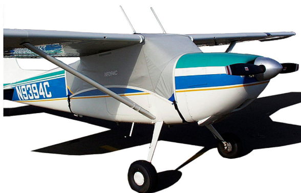
Cessna 180 Canopy Cover

This cover type is made from Silver Acrylic Sunbrella canvas and is 100% lined with a soft and smooth microfiber. Bruce's Custom Covers developed this material combination especially for aircraft protection. The outer material is medium weight and treated for water resistance, UV resistance and anti-static buildup. The inner lining is a very soft and smooth microfiber to prevent scratching. The material is very reflective, and tests show that the cabin interior temperature can be reduced to near-ambient temperature on the hottest of days. It is water, ice and snow repellent, yet breathable to allow moisture to escape from between the cover and the aircraft surface.