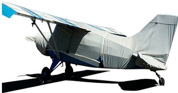
Maule Empennage, Engine & Prop Covers

WINTER USE MATERIAL - Made with Solution-Dyed Polyester fabric, this option is intended for seasonal use to aid in deicing, rain mitigation, or for occasional travel. The material is lighter and more compact, but more susceptible to UV damage and may have a shorter useful life if used continuously outside than the all-year use material.