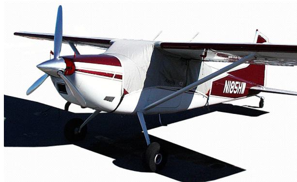
Cessna 185 Over-the-Top Canopy Cover