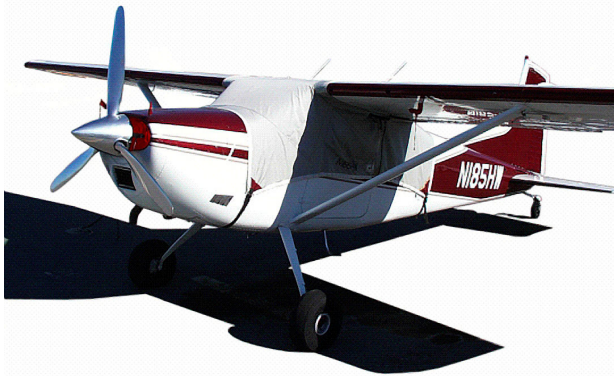
Cessna 185 Over-the-Top Canopy Cover

This cover type is made from Silver Acrylic Sunbrella canvas and is 100% lined with a soft and smooth microfiber. Bruce's Custom Covers developed this material combination especially for aircraft protection. The outer material is medium weight and treated for water resistance, UV resistance and anti-static buildup. The inner lining is a very soft and smooth microfiber to prevent scratching. The material is very reflective, and tests show that the cabin interior temperature can be reduced to near-ambient temperature on the hottest of days. It is water, ice and snow repellent, yet breathable to allow moisture to escape from between the cover and the aircraft surface.