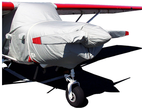
Maule Prop (2 Blade), Engine, & Canopy Cover

This cover type is made from Silver Acrylic Sunbrella canvas and is 100% lined with a soft and smooth microfiber. Bruce's Custom Covers developed this material combination especially for aircraft protection. The outer material is medium weight and treated for water resistance, UV resistance and anti-static buildup. The inner lining is a very soft and smooth microfiber to prevent scratching. The material is very reflective, and tests show that the cabin interior temperature can be reduced to near-ambient temperature on the hottest of days. It is water, ice and snow repellent, yet breathable to allow moisture to escape from between the cover and the aircraft surface.