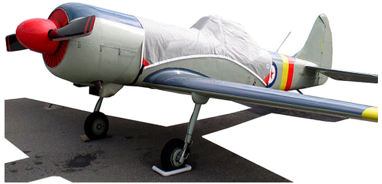
Yak 50 Canopy Cover