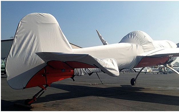
Yak 55 Full Fuselage Cover w/ Detachable Wing Covers & Propellor/Spinner Cover