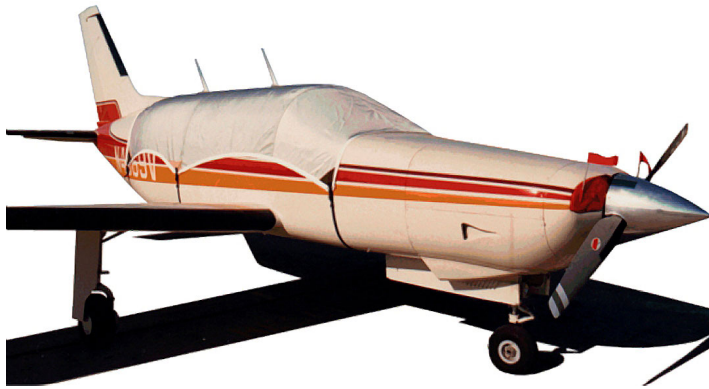
Malibu/Mirage/Meridian Standard Canopy Cover

This cover type is made from Silver Acrylic Sunbrella canvas and is 100% lined with a soft and smooth microfiber. Bruce's Custom Covers developed this material combination especially for aircraft protection. The outer material is medium weight and treated for water resistance, UV resistance and anti-static buildup. The inner lining is a very soft and smooth microfiber to prevent scratching. The material is very reflective, and tests show that the cabin interior temperature can be reduced to near-ambient temperature on the hottest of days. It is water, ice and snow repellent, yet breathable to allow moisture to escape from between the cover and the aircraft surface.