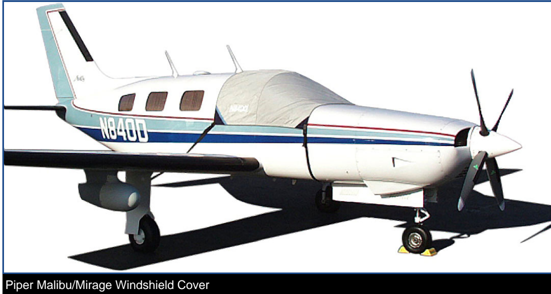
Piper Malibu/Mirage Windshield Cover