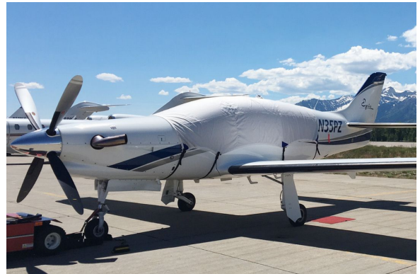
Epic LT Canopy Cover