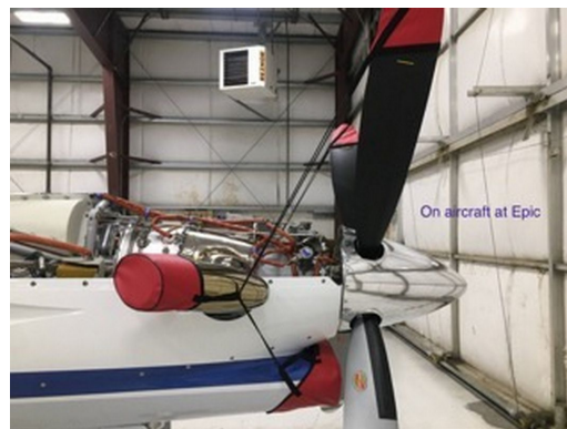
Epic Aircraft Prop Tie, Exhaust & Intake Covers