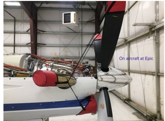
Epic Aircraft Prop Tie, Exhaust & Intake Covers