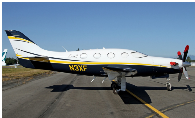
Epic LT Cockpit & Cabin HeatShields

This cover type is made from Silver Acrylic Sunbrella canvas and is 100% lined with a soft and smooth microfiber. Bruce's Custom Covers developed this material combination especially for aircraft protection. The outer material is medium weight and treated for water resistance, UV resistance and anti-static buildup. The inner lining is a very soft and smooth microfiber to prevent scratching. The material is very reflective, and tests show that the cabin interior temperature can be reduced to near-ambient temperature on the hottest of days. It is water, ice and snow repellent, yet breathable to allow moisture to escape from between the cover and the aircraft surface.