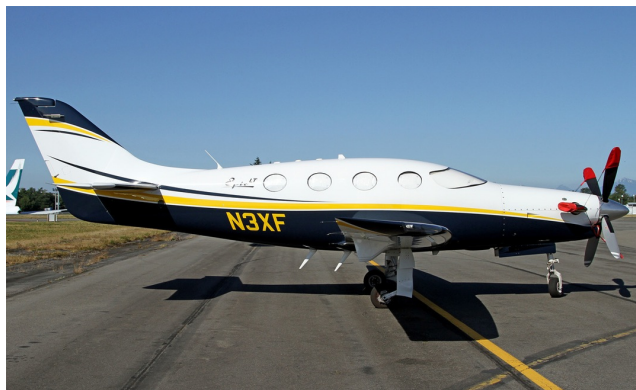
Epic LT Cockpit & Cabin HeatShields