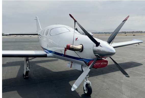
Epic E1000 Prop Tie/Exhaust Covers, Intake Cover, Windshield HeatShields