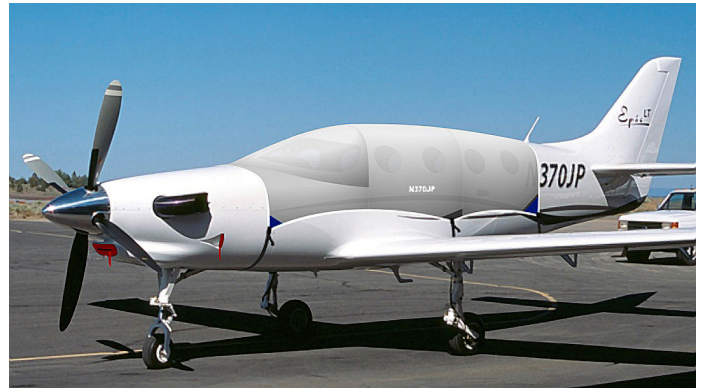
Epic LT Canopy Cover & Engine Plugs