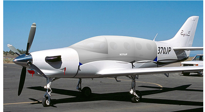
Epic E1000 Prop Tie/Exhaust Covers, Intake Cover, Windshield HeatShields