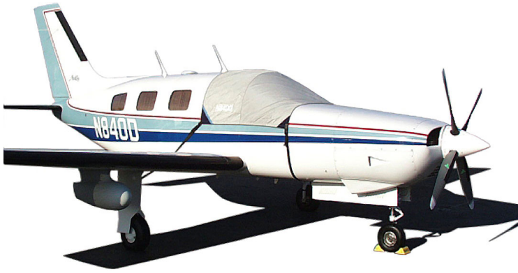
Piper Malibu/Mirage Windshield Cover