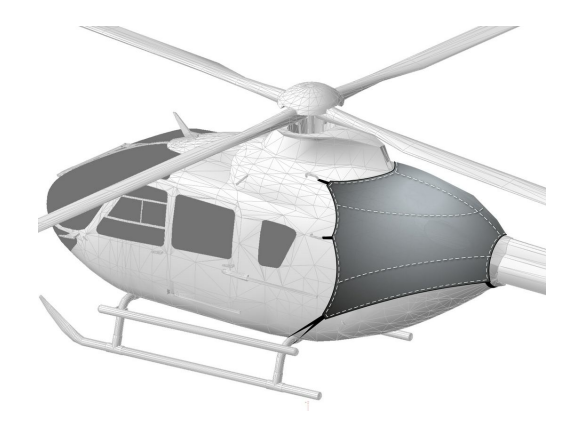
EC135 Exhaust Area Cover, illustration

The Eurocopter EC-135 Intake Cover. Details vary by model, but generally helicopter intake covers are designed to enclose the intake are only. They are smaller than helicopter engine covers, and their attachment details can vary from straps, to snaps, or some combination of the two. Specific information for each model is available on request.