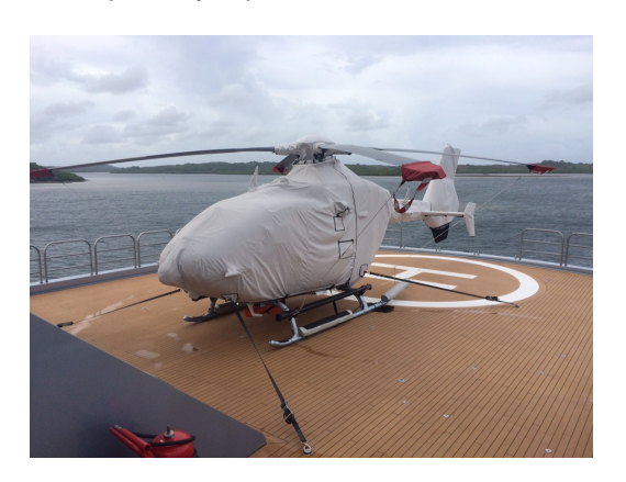
Eurocopter EC-135 Full Body Covers

The Tailboom Cover details vary by model, but generally the helicopter tail boom cover encloses the tail boom from the "bottleneck" to the aft end. They usually also cover the horizontal stabilizers, and are custom made to allow for antennae, lights, and other protrusions. They attach with straps underneath the tail boom. Covers for the vertical and horizontal stabilizers are also available separately. Specific information for each model is available on request.