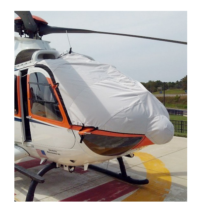
Eurocopter EC135 Bubble Cover