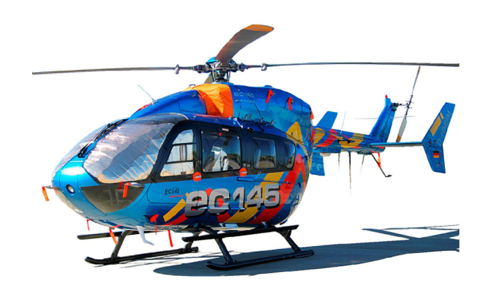
EC-145 Cabin Heatshield Set