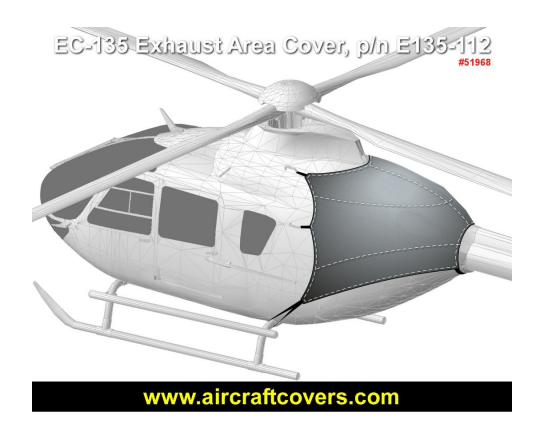
EC135 Exhaust Area Cover, illustration