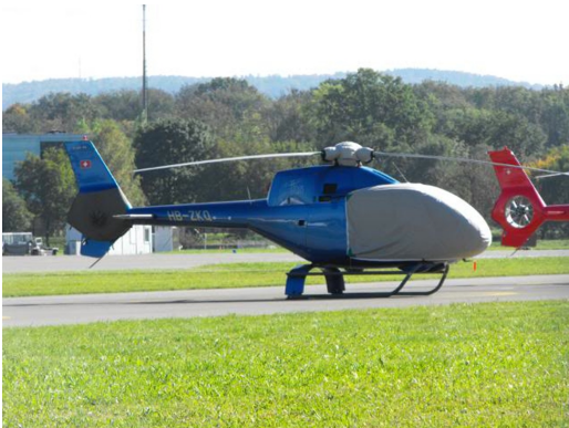
EC-130 Bubble, Tailfan, and Rotor Hub Cover

This cover type is made from Silver Acrylic Sunbrella canvas and is 100% lined with a soft and smooth microfiber. Bruce's Custom Covers developed this material combination especially for aircraft protection. The outer material is medium weight and treated for water resistance, UV resistance and anti-static buildup. The inner lining is a very soft and smooth microfiber to prevent scratching. The material is very reflective, and tests show that the cabin interior temperature can be reduced to near-ambient temperature on the hottest of days. It is water, ice and snow repellent, yet breathable to allow moisture to escape from between the cover and the aircraft surface.