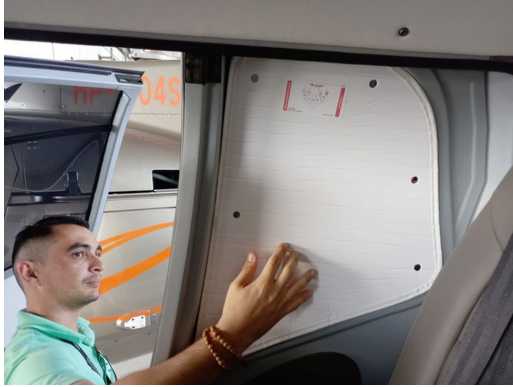
Airbus Helicopter EC130 B4 Side Window Heatshields

Heatshields are interior sunshades for an aircraft's windows or canopy glass. The product is a unique composite of closed-cell foam with a silver mylar finish. The semi-rigid design is stiff enough to stand along the inside of the windshield using sun visors or window framing. It folds up flat and easily stores in the included storage sleeve. Some designs may require velcro and suction cups. A Heatshield is an excellent short-term remedy for cockpit overheating.