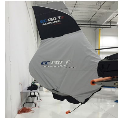
EC-130 Tailfan Cover