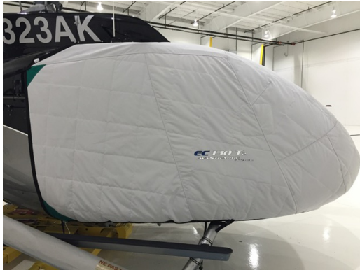
EC-130 Insulated Bubble Cover

This cover type is made from Silver Acrylic Sunbrella canvas and is 100% lined with a soft and smooth microfiber. Bruce's Custom Covers developed this material combination especially for aircraft protection. The outer material is medium weight and treated for water resistance, UV resistance and anti-static buildup. The inner lining is a very soft and smooth microfiber to prevent scratching. The material is very reflective, and tests show that the cabin interior temperature can be reduced to near-ambient temperature on the hottest of days. It is water, ice and snow repellent, yet breathable to allow moisture to escape from between the cover and the aircraft surface.