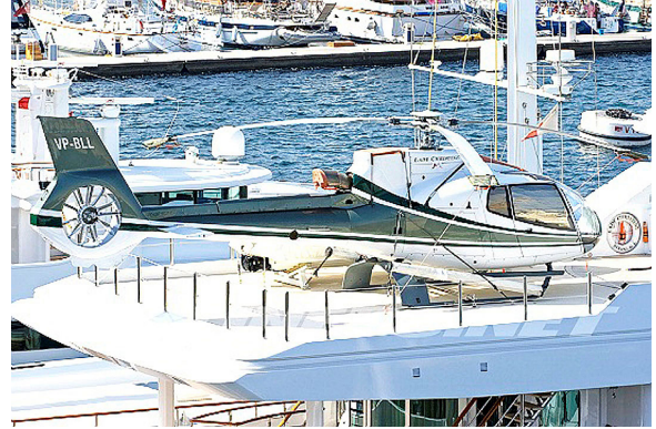
EC-130 Front, Side and Skylight Window HeatShields