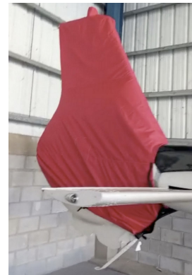
Eurocopter EC-130 Tailfan/Upper Vert Stab Housing Cover