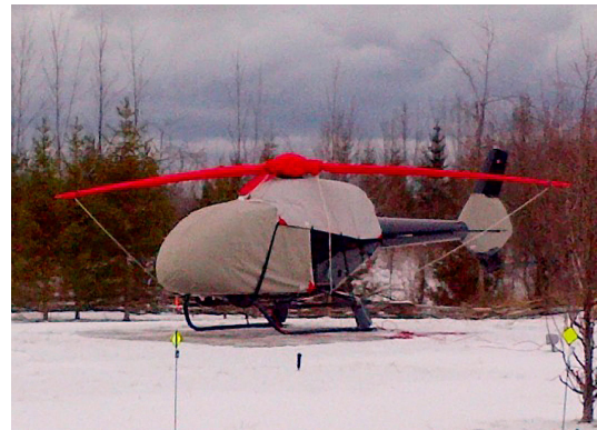
EC-130 Bubble, Engine, Rotor Hub, Blade & Tailfan Covers