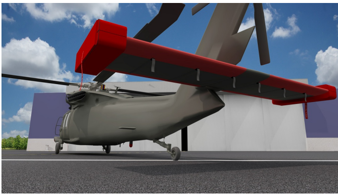
Padded Horizontal Stab Covers, Wingtip Pads (illustration)