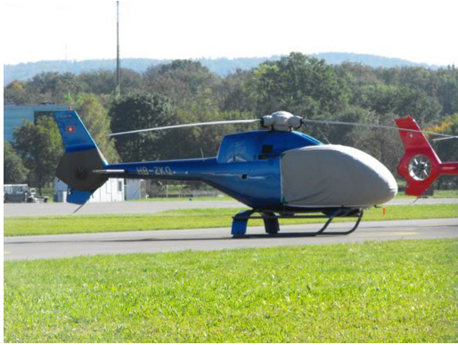
EC-130 Bubble, Tailfan, and Rotor Hub Cover

This cover type is made from Silver Acrylic Sunbrella canvas and is 100% lined with a soft and smooth microfiber. Bruce's Custom Covers developed this material combination especially for aircraft protection. The outer material is medium weight and treated for water resistance, UV resistance and anti-static buildup. The inner lining is a very soft and smooth microfiber to prevent scratching. The material is very reflective, and tests show that the cabin interior temperature can be reduced to near-ambient temperature on the hottest of days. It is water, ice and snow repellent, yet breathable to allow moisture to escape from between the cover and the aircraft surface.