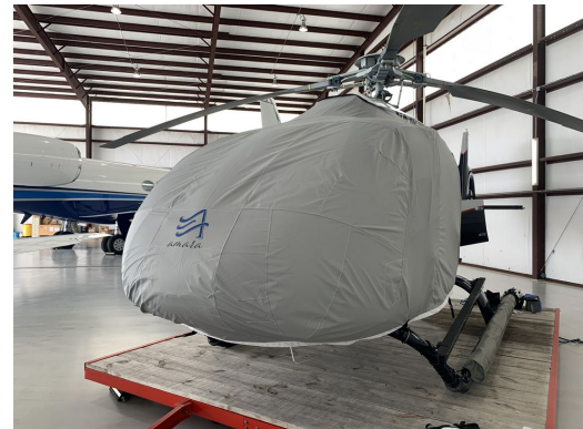
Airbus H-130 Bubble Cover, Travel Weight