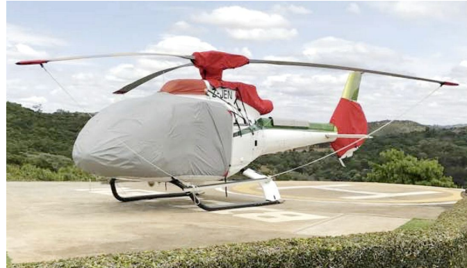
EC130 Bubble, Intake, Exhaust, Rotor Hub & Tailfan Covers