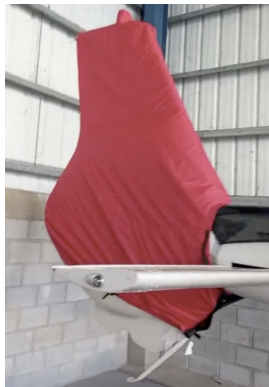
Eurocopter EC-130 Tailfan/Upper Vert Stab Housing Cover

The Tailboom Cover details vary by model, but generally the helicopter tail boom cover encloses the tail boom from the "bottleneck" to the aft end. They usually also cover the horizontal stabilizers, and are custom made to allow for antennae, lights, and other protrusions. They attach with straps underneath the tail boom. Covers for the vertical and horizontal stabilizers are also available separately. Specific information for each model is available on request.