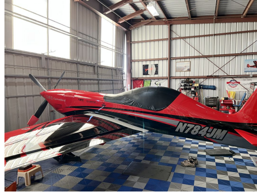
Gamebird GB-1 Solar Cap (single place), CUSTOM COVERS & IMPRINTING AVAILABLE!