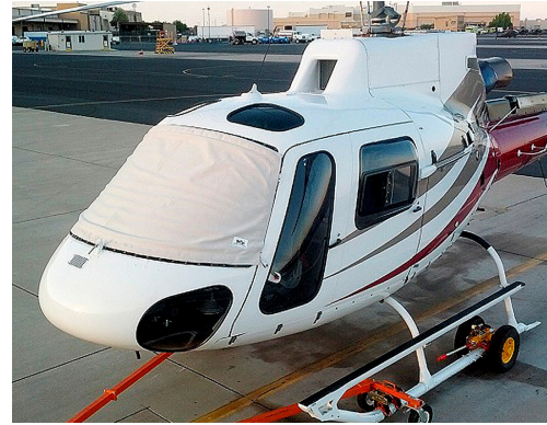
AS350 Windshield Cover, pinches in door jambs