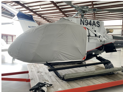
Airbus H-130 Bubble Cover, Travel Weight

This cover type is made from Silver Acrylic Sunbrella canvas and is 100% lined with a soft and smooth microfiber. Bruce's Custom Covers developed this material combination especially for aircraft protection. The outer material is medium weight and treated for water resistance, UV resistance and anti-static buildup. The inner lining is a very soft and smooth microfiber to prevent scratching. The material is very reflective, and tests show that the cabin interior temperature can be reduced to near-ambient temperature on the hottest of days. It is water, ice and snow repellent, yet breathable to allow moisture to escape from between the cover and the aircraft surface.