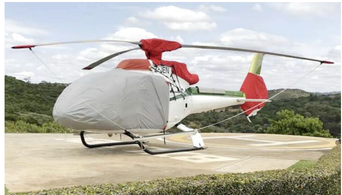
EC130 Bubble, Intake, Exhaust, Rotor Hub & Tailfan Covers