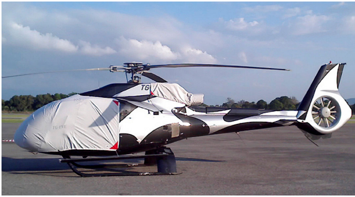
Bubble Cover and Intake/Exhaust Cover