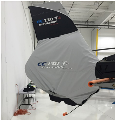
EC-130 Tailfan Cover

The Tailboom Cover details vary by model, but generally the helicopter tail boom cover encloses the tail boom from the "bottleneck" to the aft end. They usually also cover the horizontal stabilizers, and are custom made to allow for antennae, lights, and other protrusions. They attach with straps underneath the tail boom. Covers for the vertical and horizontal stabilizers are also available separately. Specific information for each model is available on request.