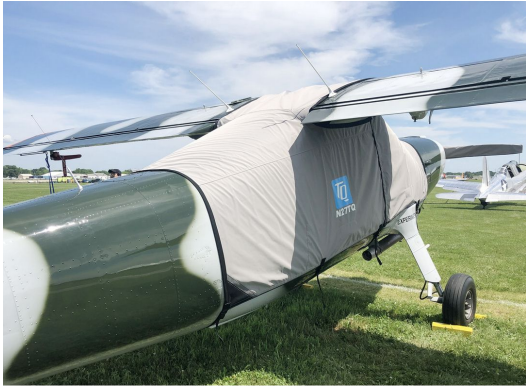
Dornier DO-27 Canopy Cover