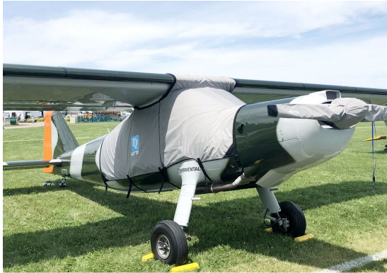
Dornier DO-27 Canopy Cover, Prop Cover

This cover type is made from Silver Acrylic Sunbrella canvas and is 100% lined with a soft and smooth microfiber. Bruce's Custom Covers developed this material combination especially for aircraft protection. The outer material is medium weight and treated for water resistance, UV resistance and anti-static buildup. The inner lining is a very soft and smooth microfiber to prevent scratching. The material is very reflective, and tests show that the cabin interior temperature can be reduced to near-ambient temperature on the hottest of days. It is water, ice and snow repellent, yet breathable to allow moisture to escape from between the cover and the aircraft surface.