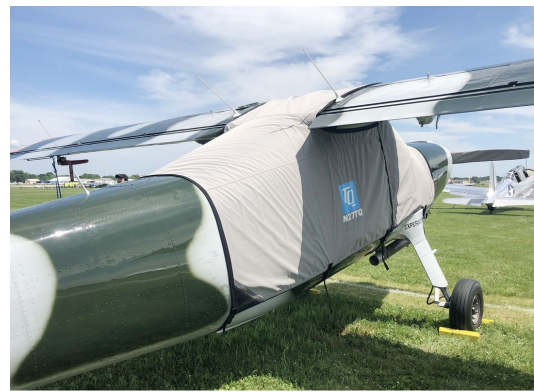
Dornier DO-27 Canopy Cover