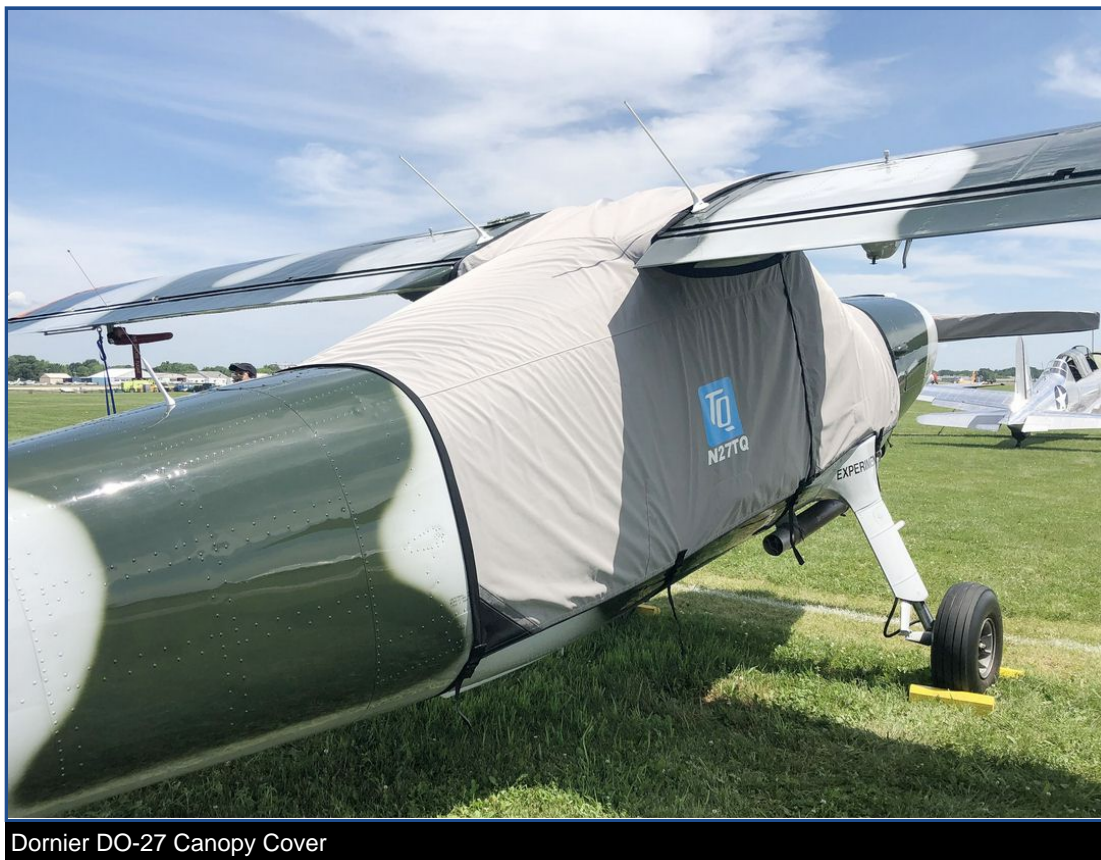
Dornier DO-27 Canopy Cover