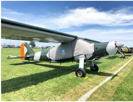
Dornier DO-27 Canopy Cover, Prop Cover