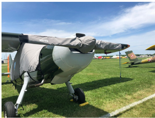
Dornier DO-27 Canopy Cover, Prop Cover