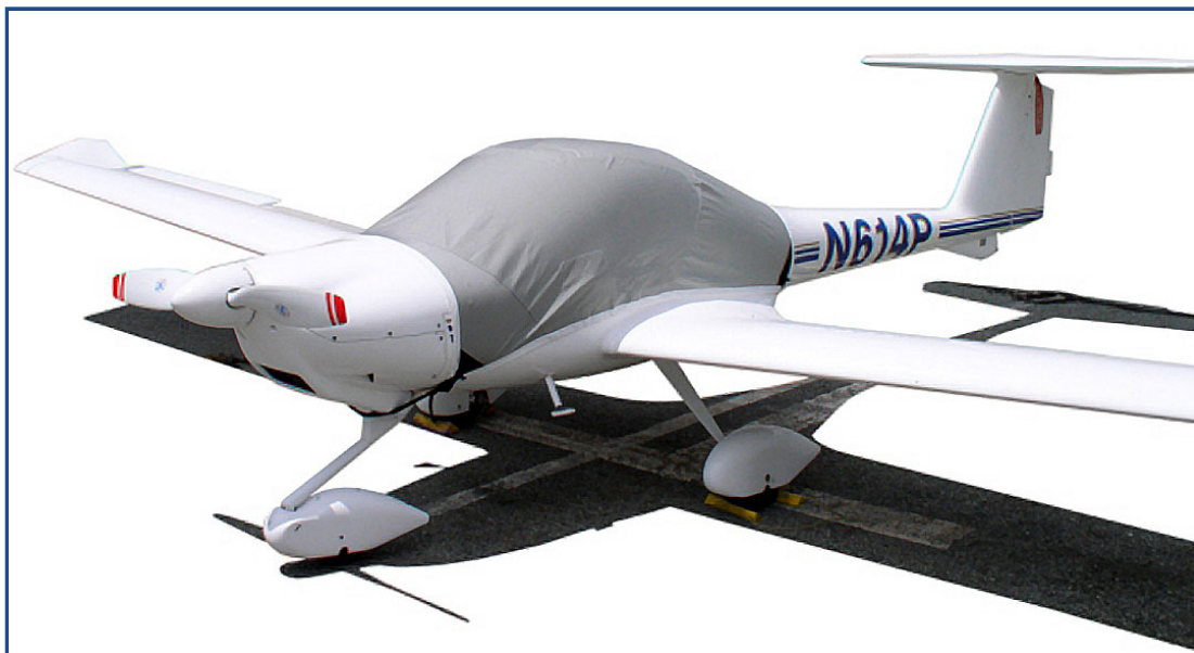
Diamond DA-20 Canopy Cover