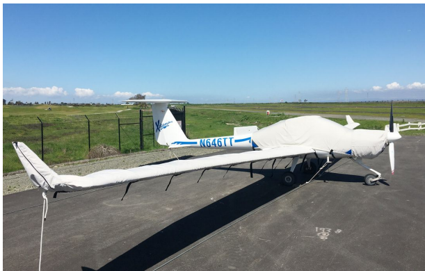
Dimona/Diamond HK36 Extreme Canopy/Engine, Wing Covers