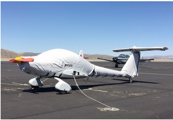
Dimona HK-36 Extended Canopy/Engine Cover, Empennage Cover Set