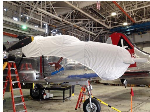
B25 Cockpit/Nose Cover