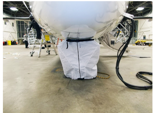
Q400, Nose gear landing/tire covers - Cold Weather Ops