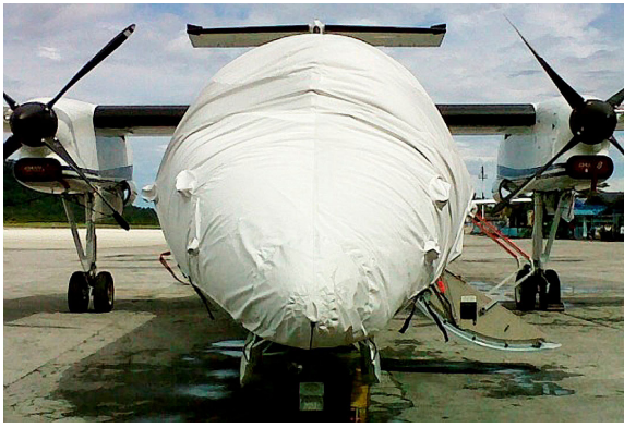
De Havilland Dash 8 Cockpit/Nose Cover