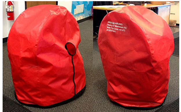
Boeing 757 Tire Covers, great for Wash Prep or Storage