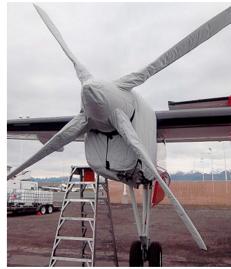
Dash 8 Insulated Engine & Prop Covers