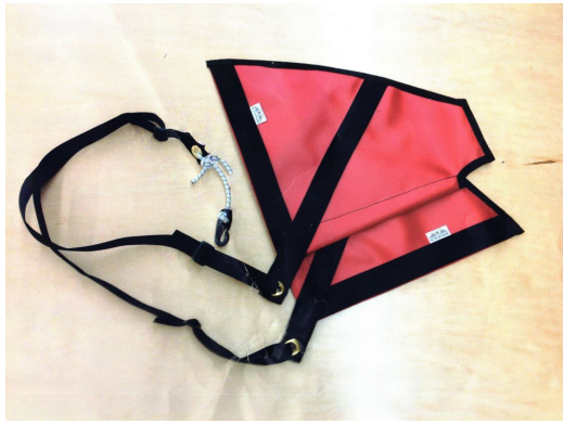
Aerospatiale ATR-42/72 Prop Tie-Downs