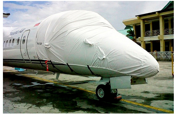
De Havilland Dash 8 Cockpit/Nose Cover