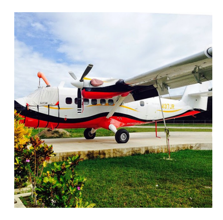
Twin Otter Cockpit Cover & Engine Plugs