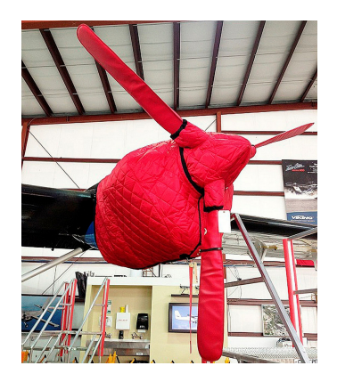
De Havilland Twin Otter Engine Inlet Plug and Exhaust Covers