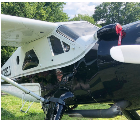
DeHavilland DH-2 Upper Cowling Air Scoop Plug

Engine Inlet Plugs are custom fit for your DeHavilland Beaver DHC-2, U-6A, U-6B intakes, made with heavy-duty vinyl material, and stuffed with a single block of sculpted urethane foam. Each plug has a zipper that allows the foam to be removed and dried if necessary. Engine plugs have warning flags that are visible from the cockpit or 'remove before flight' streamers sewn onto the face of the plugs. Most plugs are imprinted with the aircraft registration number in black for an extra charge. Storage bag NOT included. Engine plugs may be inserted after flight when the engine is still warm. Engine Inlet Plugs are commonly referred to as Cowl Plugs, Intake Plugs, Cowl Blocks, Engine Blocks, and Engine Bungs.