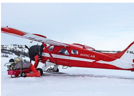
DeHavilland DH-2 Beaver Insulated Engine Cover