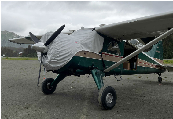
DeHavilland DH-2 Beaver Cockpit/Engine Cover

This cover type is made from Silver Acrylic Sunbrella canvas and is 100% lined with a soft and smooth microfiber. Bruce's Custom Covers developed this material combination especially for aircraft protection. The outer material is medium weight and treated for water resistance, UV resistance and anti-static buildup. The inner lining is a very soft and smooth microfiber to prevent scratching. The material is very reflective, and tests show that the cabin interior temperature can be reduced to near-ambient temperature on the hottest of days. It is water, ice and snow repellent, yet breathable to allow moisture to escape from between the cover and the aircraft surface.