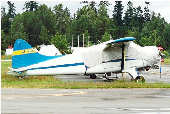
Beaver Canopy/Engine Cover