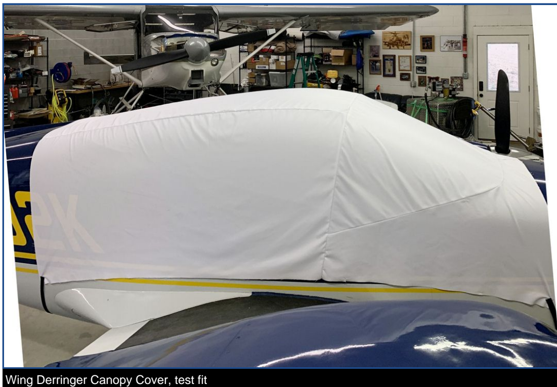
Wing Derringer Canopy Cover, test fit