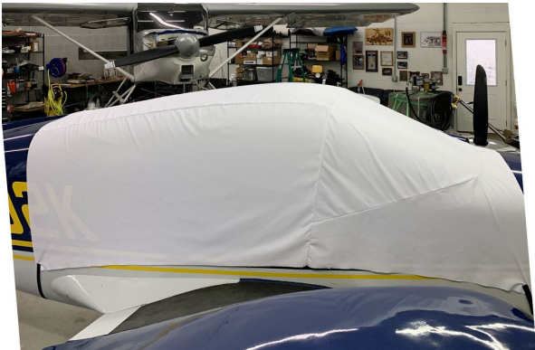
Wing Derringer Canopy Cover, test fit