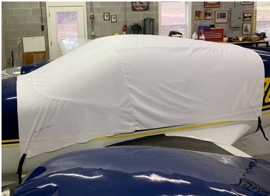
Wing Derringer Canopy Cover, test fit

This cover type is made from Silver Acrylic Sunbrella canvas and is 100% lined with a soft and smooth microfiber. Bruce's Custom Covers developed this material combination especially for aircraft protection. The outer material is medium weight and treated for water resistance, UV resistance and anti-static buildup. The inner lining is a very soft and smooth microfiber to prevent scratching. The material is very reflective, and tests show that the cabin interior temperature can be reduced to near-ambient temperature on the hottest of days. It is water, ice and snow repellent, yet breathable to allow moisture to escape from between the cover and the aircraft surface.