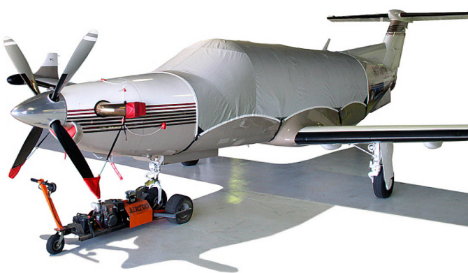
PC-12 Canopy Cover, Engine Plugs, Prop Tie/Exhaust Covers