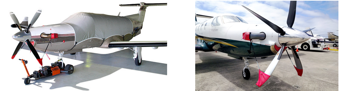
PC-12 Canopy Cover, Engine Plugs, Prop Tie/Exhaust Covers Main Intake Plug and Prop-Tie/Exhaust Covers. (Sold Separately)

Engine Inlet Plugs are custom fit for your Beech Denali 220 intakes, made with heavy-duty vinyl material, and stuffed with a single block of sculpted urethane foam. Each plug has a zipper that allows the foam to be removed and dried if necessary. Engine plugs have warning flags that are visible from the cockpit or 'remove before flight' streamers sewn onto the face of the plugs. Most plugs are imprinted with the aircraft registration number in black for an extra charge. Storage bag NOT included. Engine plugs may be inserted after flight when the engine is still warm. Engine Inlet Plugs are commonly referred to as Cowl Plugs, Intake Plugs, Cowl Blocks, Engine Blocks, and Engine Bungs.