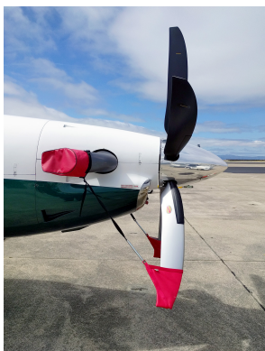
Pilatus PC-12 Prop Tie-Down/Exhaust Cover Set, 5 Blade

This cover type is made from Silver Acrylic Sunbrella canvas and is 100% lined with a soft and smooth microfiber. Bruce's Custom Covers developed this material combination especially for aircraft protection. The outer material is medium weight and treated for water resistance, UV resistance and anti-static buildup. The inner lining is a very soft and smooth microfiber to prevent scratching. The material is very reflective, and tests show that the cabin interior temperature can be reduced to near-ambient temperature on the hottest of days. It is water, ice and snow repellent, yet breathable to allow moisture to escape from between the cover and the aircraft surface.