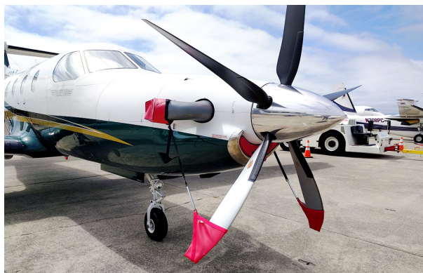
Pilatus PC-12 Prop Cover, Prop Tie/Exhaust Cover