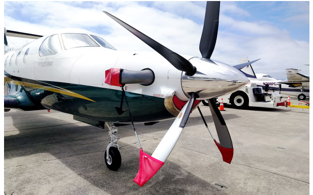
Main Intake Plug and Prop-Tie/Exhaust Covers. (Sold Separately)