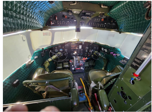
DC-3C Cockpit Heatshields