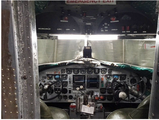
Douglas DC-3 Cockpit Heatshields

Cockpit Heatshields are interior sunshades for the aircraft's cockpit. The product is a unique composite of closed-cell foam with a silver mylar finish. The semi-rigid design is stiff enough to stand inside the window framing. The set folds up flat and is easily stored in the included storage sleeve. Some designs may require velcro and suction cups. A Heatshield is an excellent short-term remedy for cockpit overheating, but an external fabric cover is more effective for long-term protection.