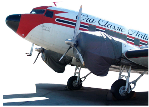
DC3 Engine Covers are custom made for various engine mod's.