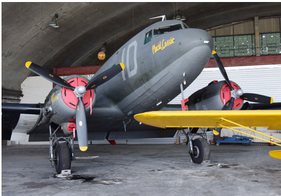
Douglas DC-3 Engine & Oil Cooler Plugs

Engine Inlet Plugs are custom fit for your Douglas DC-3 intakes, made with heavy-duty vinyl material, and stuffed with a single block of sculpted urethane foam. Each plug has a zipper that allows the foam to be removed and dried if necessary. Engine plugs have warning flags that are visible from the cockpit or 'remove before flight' streamers sewn onto the face of the plugs. Most plugs are imprinted with the aircraft registration number in black for an extra charge. Storage bag NOT included. Engine plugs may be inserted after flight when the engine is still warm. Engine Inlet Plugs are commonly referred to as Cowl Plugs, Intake Plugs, Cowl Blocks, Engine Blocks, and Engine Bungs.