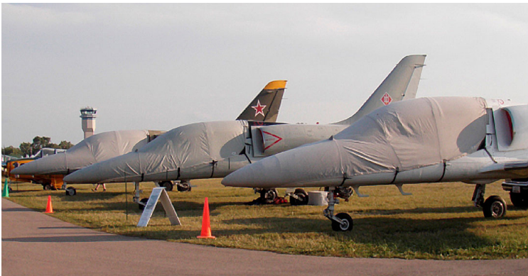
L-39 Canopy/Nose Covers & Plugs