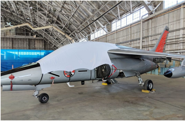
Dornier Alpha Jet Canopy Cover, test fit cover

This cover type is made from Silver Acrylic Sunbrella canvas and is 100% lined with a soft and smooth microfiber. Bruce's Custom Covers developed this material combination especially for aircraft protection. The outer material is medium weight and treated for water resistance, UV resistance and anti-static buildup. The inner lining is a very soft and smooth microfiber to prevent scratching. The material is very reflective, and tests show that the cabin interior temperature can be reduced to near-ambient temperature on the hottest of days. It is water, ice and snow repellent, yet breathable to allow moisture to escape from between the cover and the aircraft surface.