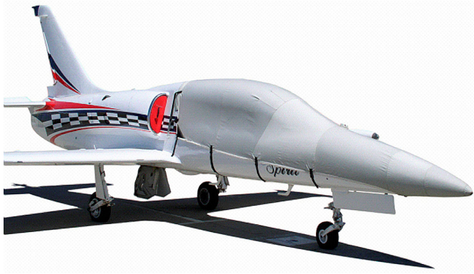
L39 Canopy/Nose Cover & Intake Plugs