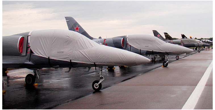
L-39 Canopy/Nose Covers & Plugs