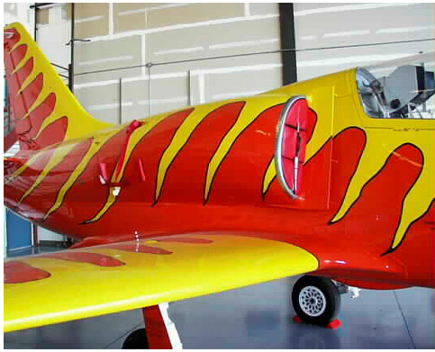
Inlet Plug, folding type