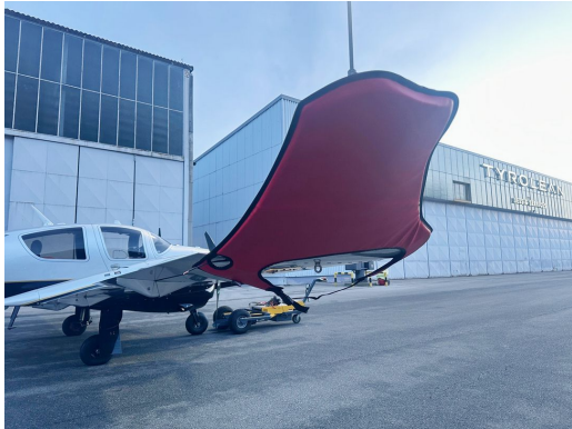
Diamond DA-62 Wingtip Pads

Designed to prevent damage to the aircraft extremities in crowded hangars, these products are made of bright red Naugahyde and thickly padded with a sandwich of closed cell foam. Nowadays they are also made using bright read Neoprene padded laminated (think: wetsuit material).