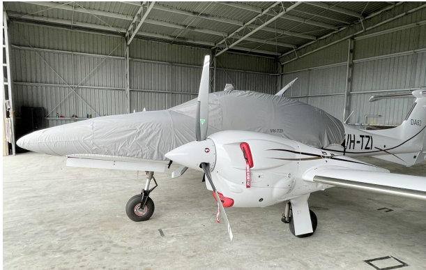
Diamond DA-62 Canopy/Nose Cover, Engine Plugs

Engine Inlet Plugs are custom fit for your Diamond DA-62 intakes, made with heavy-duty vinyl material, and stuffed with a single block of sculpted urethane foam. Each plug has a zipper that allows the foam to be removed and dried if necessary. Engine plugs have warning flags that are visible from the cockpit or 'remove before flight' streamers sewn onto the face of the plugs. Most plugs are imprinted with the aircraft registration number in black for an extra charge. Storage bag NOT included. Engine plugs may be inserted after flight when the engine is still warm. Engine Inlet Plugs are commonly referred to as Cowl Plugs, Intake Plugs, Cowl Blocks, Engine Blocks, and Engine Bungs.