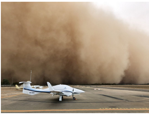
Diamond DA-42 Canopy/Nose Cover