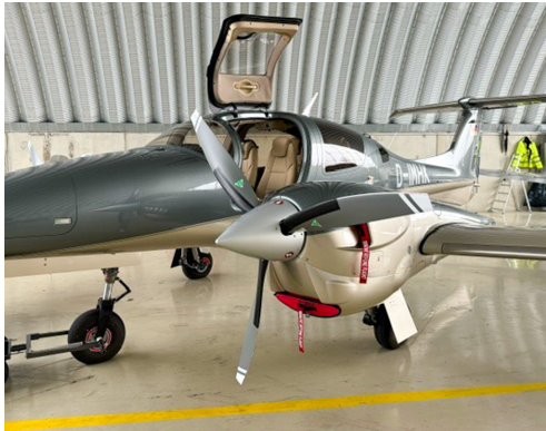
Diamond DA-62 Engine Inlet Plugs