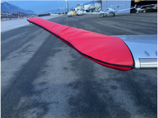
Diamond DA-62 Wingtip Pads