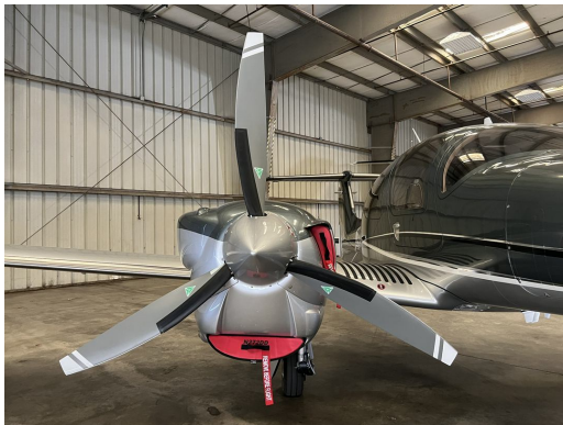
Diamond DA-62 Engine Plugs

Engine Inlet Plugs are custom fit for your Diamond DA-62 intakes, made with heavy-duty vinyl material, and stuffed with a single block of sculpted urethane foam. Each plug has a zipper that allows the foam to be removed and dried if necessary. Engine plugs have warning flags that are visible from the cockpit or 'remove before flight' streamers sewn onto the face of the plugs. Most plugs are imprinted with the aircraft registration number in black for an extra charge. Storage bag NOT included. Engine plugs may be inserted after flight when the engine is still warm. Engine Inlet Plugs are commonly referred to as Cowl Plugs, Intake Plugs, Cowl Blocks, Engine Blocks, and Engine Bungs.