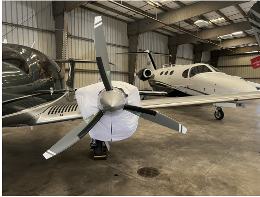
Diamond DA-62 Engine Cover, test fit cover