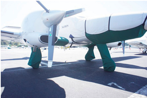
Twinstar Landing Gear & Gearwell Covers