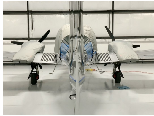
Diamond DA-62 Travel Weight Canopy & Engine Covers