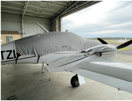
DA-62 Travel Weight Canopy/Nose Cover