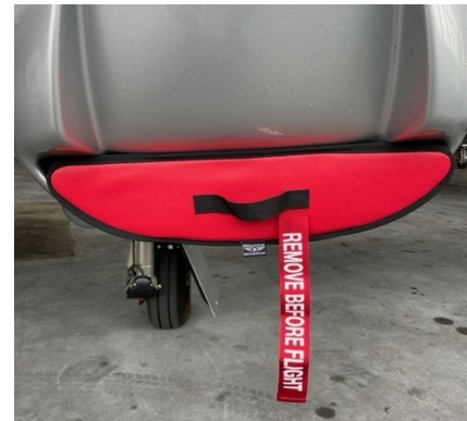
Diamond DA-62 Engine Inlet Plugs