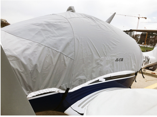
Diamond DA-62 Travel Cover, Light Weight Travel Canopy Cover