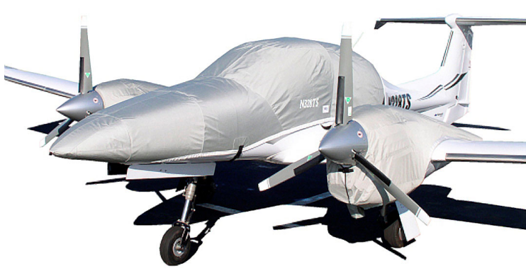
Diamond Twinstar Canopy/Nose Cover & Engine Covers