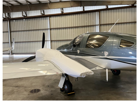
Diamond DA-62 Engine Cover, test fit cover