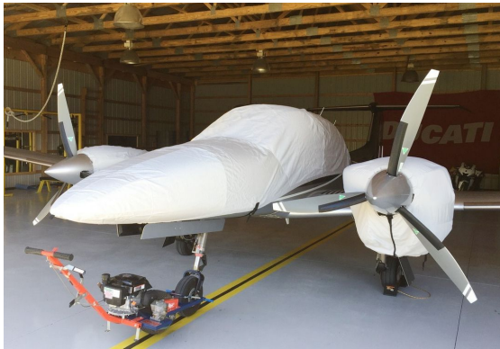
Diamond DA-42-VI Canopy/Nose & Engine Covers