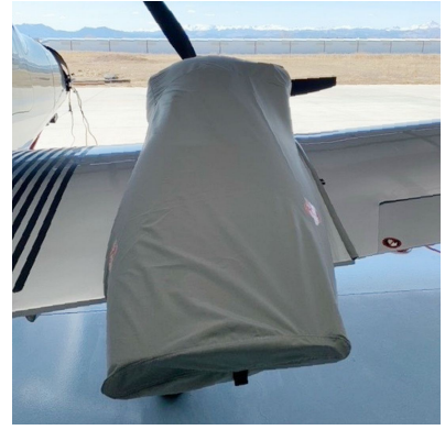
Diamond DA-62 Travel Weight Engine Covers