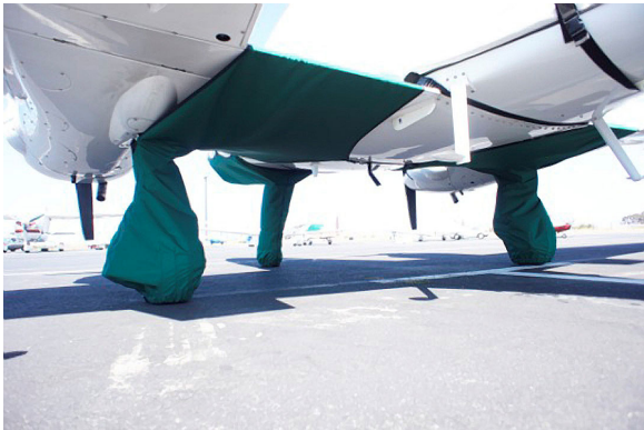
Twinstar Landing Gear & Gearwell Covers