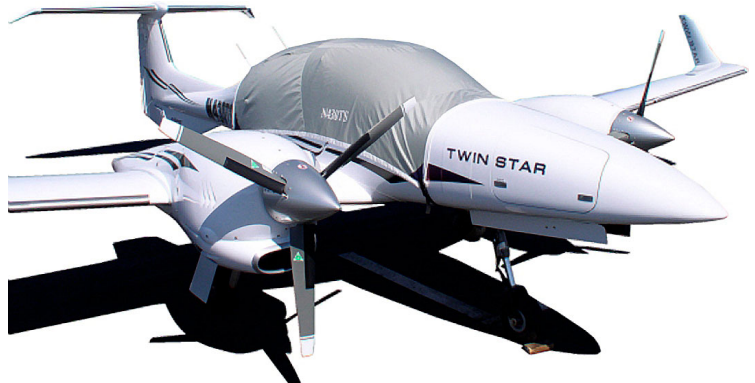
Twinstar Standard Canopy Cover