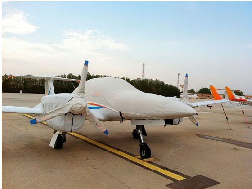
Diamond DA-42NG Canopy/Nose, Engine & Prop Covers