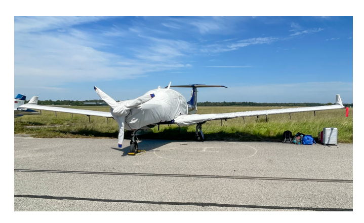
Diamond DA-50 Extended Canopy/Engine, Prop & Wing Covers Diamond DA-50 Extended Canopy/Engine Cover, Wing & Prop (test fit) Covers