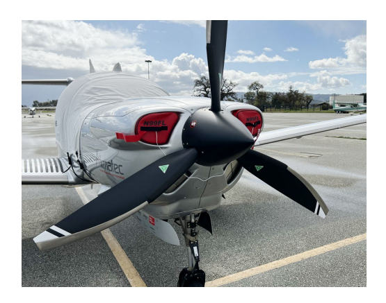
Diamond DA-50 Engine Plugs