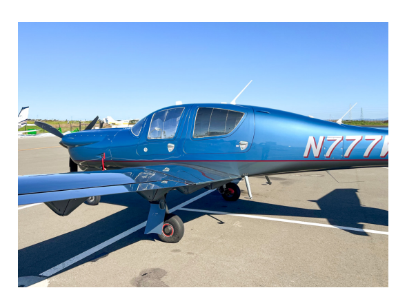
Diamond DA-50 HeatShield Set