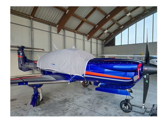
Diamond DA-50 Canopy Cover, Engine Plugs

Engine Inlet Plugs are custom fit for your Diamond DA-50 Superstar intakes, made with heavy-duty vinyl material, and stuffed with a single block of sculpted urethane foam. Each plug has a zipper that allows the foam to be removed and dried if necessary. Engine plugs have warning flags that are visible from the cockpit or 'remove before flight' streamers sewn onto the face of the plugs. Most plugs are imprinted with the aircraft registration number in black for an extra charge. Storage bag NOT included. Engine plugs may be inserted after flight when the engine is still warm. Engine Inlet Plugs are commonly referred to as Cowl Plugs, Intake Plugs, Cowl Blocks, Engine Blocks, and Engine Bungs.