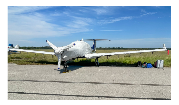
Diamond DA-50 Extended Canopy/Engine Cover, Wing & Prop Covers