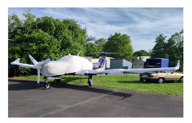
Diamond DA-50 Extended Canopy/Engine, Prop & Wing Covers (test fit)