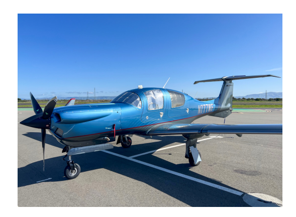
Diamond DA-50 HeatShield Set

Cabin Heatshields are interior sunshades for the aircraft's passenger cabin area. The product is a unique composite of closed-cell foam with a silver mylar finish. The semi-rigid design is stiff enough to stand inside the window framing. The set folds up flat and is easily stored in the included storage sleeve. Some designs may require velcro and suction cups. A Heatshield is an excellent short-term remedy for cockpit overheating, but an external fabric cover is more effective for long-term protection.