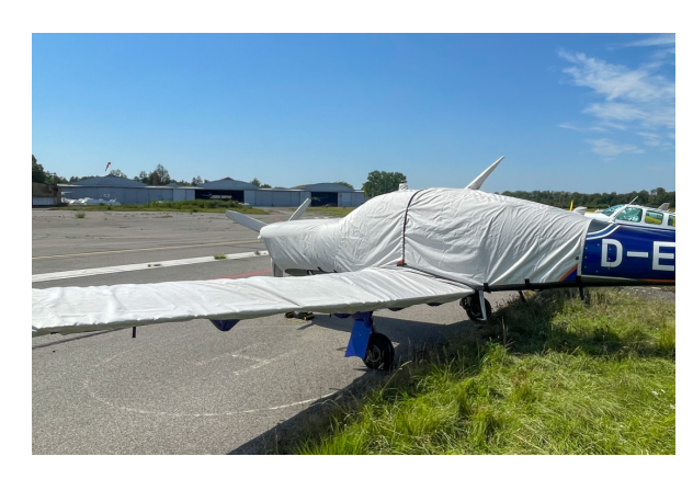
Diamond DA-50 Extended Canopy/Engine Cover, Wing Covers

This cover type is made from Silver Acrylic Sunbrella canvas and is 100% lined with a soft and smooth microfiber. Bruce's Custom Covers developed this material combination especially for aircraft protection. The outer material is medium weight and treated for water resistance, UV resistance and anti-static buildup. The inner lining is a very soft and smooth microfiber to prevent scratching. The material is very reflective, and tests show that the cabin interior temperature can be reduced to near-ambient temperature on the hottest of days. It is water, ice and snow repellent, yet breathable to allow moisture to escape from between the cover and the aircraft surface.