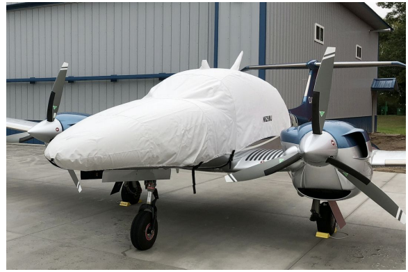
Diamond DA-62 Canopy/Nose Cover