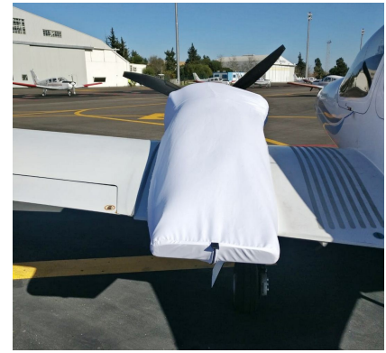
DA42 MPP Guardian (DA42-NG) Engine Cover, test fit cover