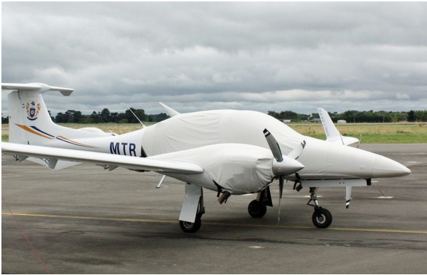
Diamond DA-42 Canopy/Nose & Engine Cover