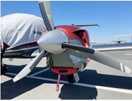
Diamond DA-42 Engine Inlet Plugs