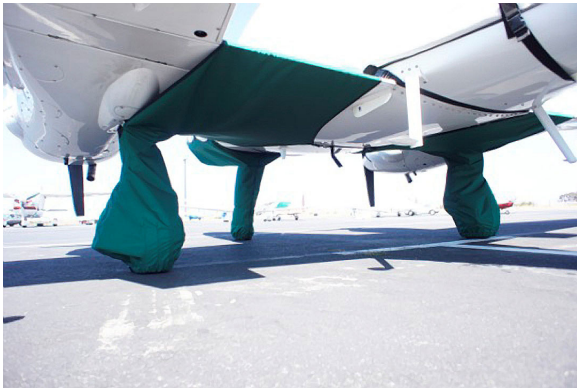
Twinstar Landing Gear & Gearwell Covers