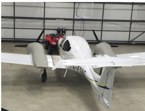
Diamond DA-42 Twinstar Engine Covers

WINTER USE MATERIAL - Made with Solution-Dyed Polyester fabric, this option is intended for seasonal use to aid in deicing, rain mitigation, or for occasional travel. The material is lighter and more compact, but more susceptible to UV damage and may have a shorter useful life if used continuously outside than the all-year use material.