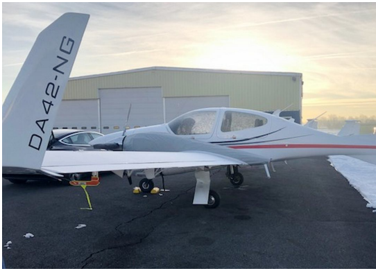
Diamond DA-42 Twin Star Travel Cover, Light Weight Travel Engine Covers, Specify Engine Type