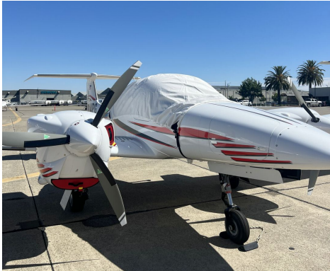
Diamond DA-42 Twin Star Canopy Cover