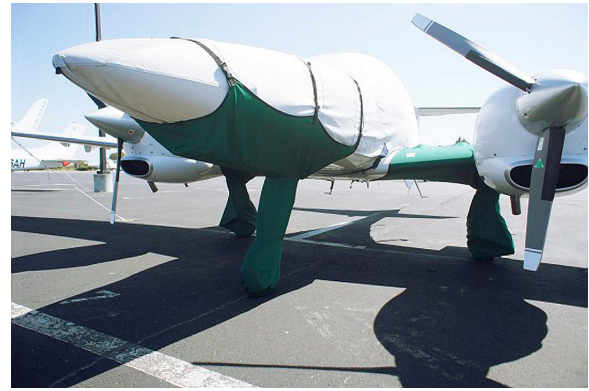
Diamond DA-42 Twinstar Landing Gear & Gearwell Covers