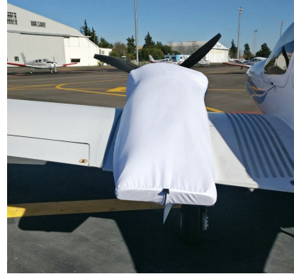
DA42 MPP Guardian (DA42-NG) Engine Cover, test fit cover