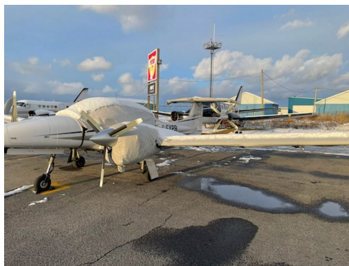
Diamond DA-42 Canopy, Wing, Engine & Horizontal Stabilizer Covers