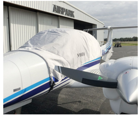
Diamond DA-42 Twin Star Canopy Cover