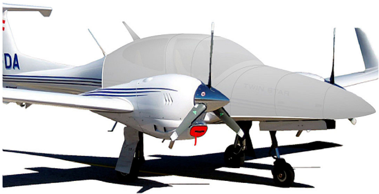
Twinstar Extended Canopy/Nose Cover & Engine Plugs (Illustration)

Engine Inlet Plugs are custom fit for your Diamond DA-42 Twin Star intakes, made with heavy-duty vinyl material, and stuffed with a single block of sculpted urethane foam. Each plug has a zipper that allows the foam to be removed and dried if necessary. Engine plugs have warning flags that are visible from the cockpit or 'remove before flight' streamers sewn onto the face of the plugs. Most plugs are imprinted with the aircraft registration number in black for an extra charge. Storage bag NOT included. Engine plugs may be inserted after flight when the engine is still warm. Engine Inlet Plugs are commonly referred to as Cowl Plugs, Intake Plugs, Cowl Blocks, Engine Blocks, and Engine Bungs.