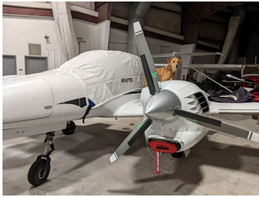
Diamond DA-42 NG Canopy Cover, Engine Plugs