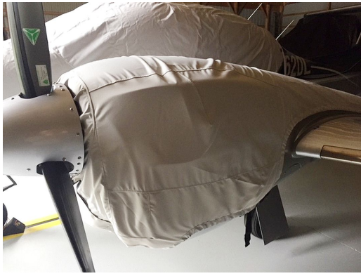
Diamond DA42-VI Canopy/Nose Cover