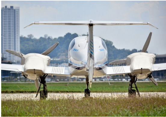
Diamond DA-42NG Engine & Prop Covers

The material is very reflective, and tests show that the cabin interior temperature can be reduced to near-ambient temperature on the hottest of days. It is water, ice and snow repellent, yet breathable to allow moisture to escape from between the cover and the aircraft surface.