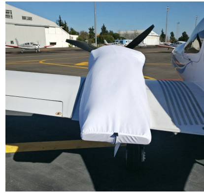
DA42 MPP Guardian (DA42-NG) Engine Cover, test fit cover