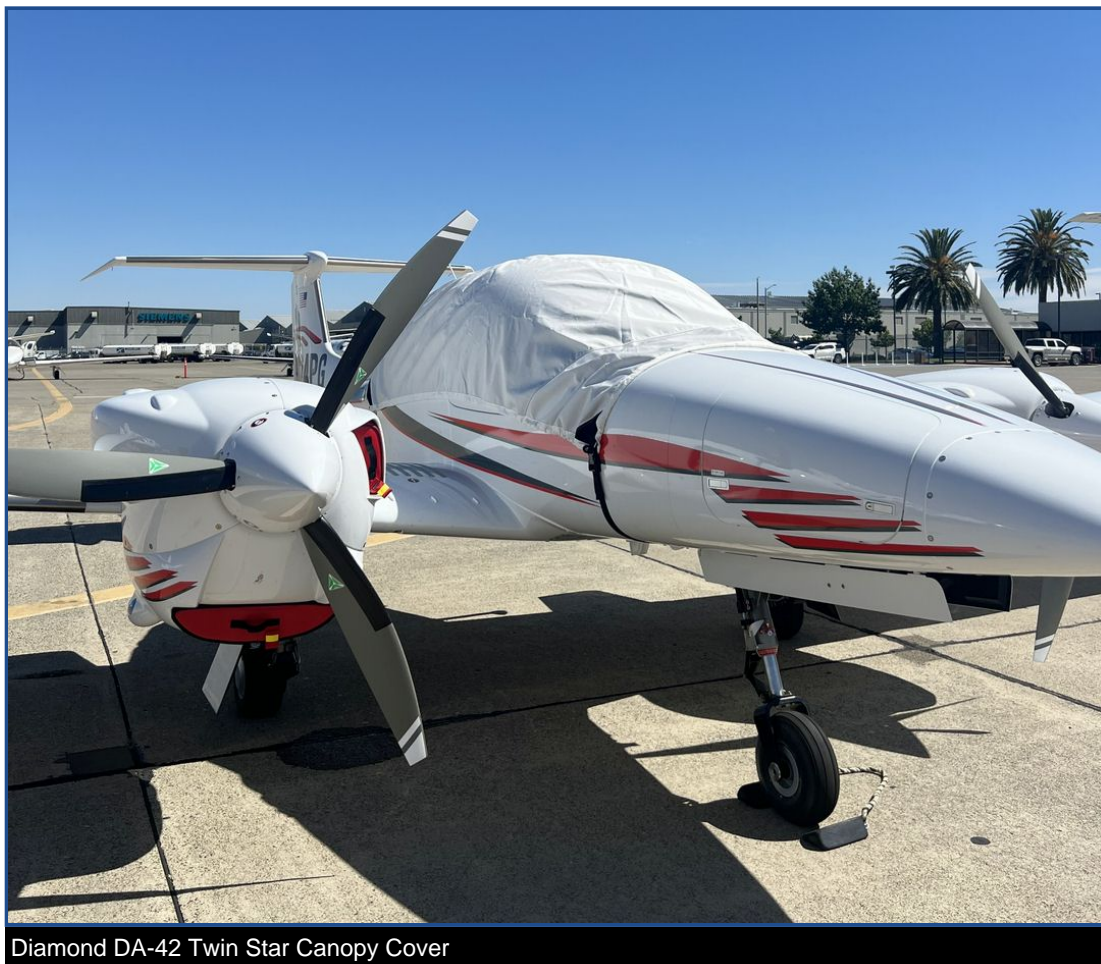
Diamond DA-42 Twin Star Canopy Cover