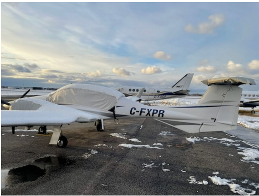
Diamond DA-42 Canopy, Wing, Engine & Horizontal Stabilizer Covers