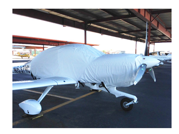
Diamond DA-40NG Extended Canopy/Engine Cover

This cover type is made from Silver Acrylic Sunbrella canvas and is 100% lined with a soft and smooth microfiber. Bruce's Custom Covers developed this material combination especially for aircraft protection. The outer material is medium weight and treated for water resistance, UV resistance and anti-static buildup. The inner lining is a very soft and smooth microfiber to prevent scratching. The material is very reflective, and tests show that the cabin interior temperature can be reduced to near-ambient temperature on the hottest of days. It is water, ice and snow repellent, yet breathable to allow moisture to escape from between the cover and the aircraft surface.