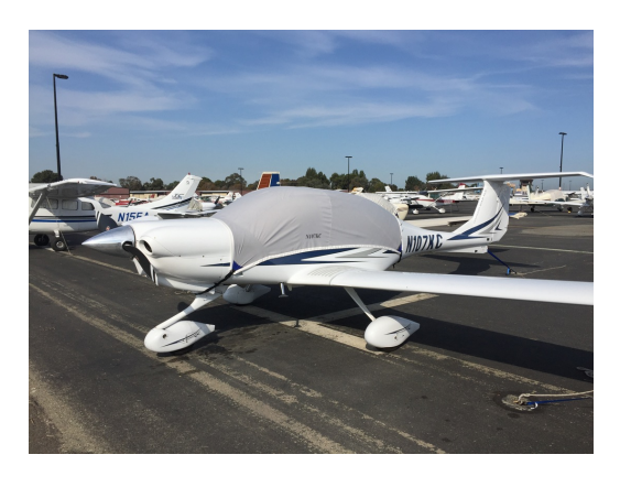
Diamond DA-40 Travel Cover, Light Weight Travel Canopy Cover