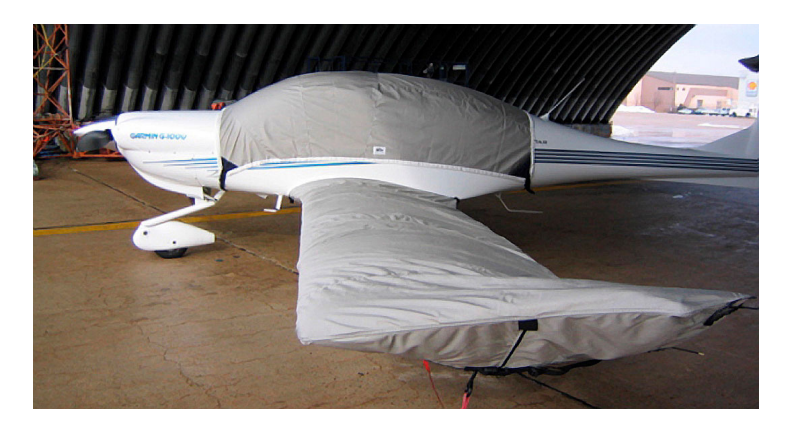
Diamond DA-40 Canopy & Wing Covers

WINTER USE MATERIAL - Made with Solution-Dyed Polyester fabric, this option is intended for seasonal use to aid in deicing, rain mitigation, or for occasional travel. The material is lighter and more compact, but more susceptible to UV damage and may have a shorter useful life if used continuously outside than the all-year use material.