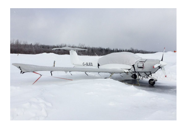
Diamond DA40 Canopy, Insulated Engine, Wing and Stab. Covers