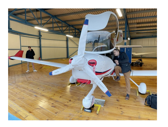
DA40 NG Engine Plugs