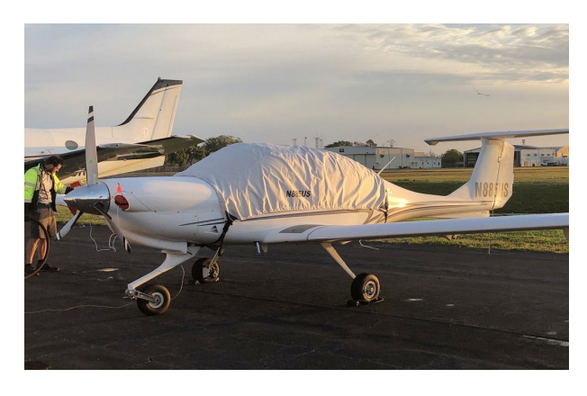
Diamond DA-40 Canopy Cover & Engine Plugs