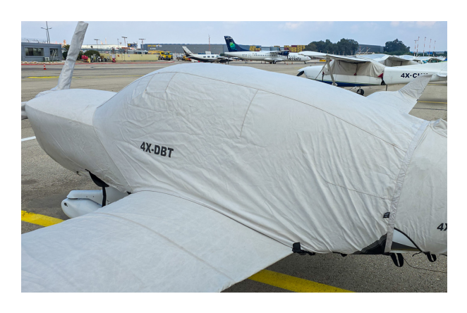
Diamond DA-40 Extended Canopy/Engine Cover, Ng Model (Aft Scoop Ext.)