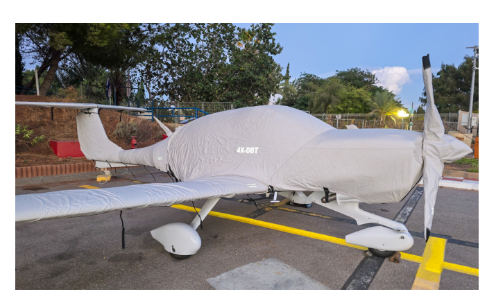
Diamond DA-40 Complete Cover Set