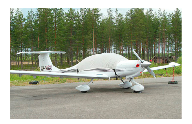
Diamond DA-40 Canopy Cover, Engine Plugs