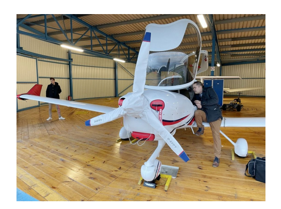
DA40 NG Engine Plugs

Designed to prevent damage to the aircraft extremities in crowded hangars, these products are made of bright red Naugahyde and thickly padded with a sandwich of closed cell foam.