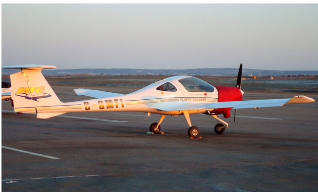
Diamond DA-20 Insulated Engine Cover

This cover type is made from Silver Acrylic Sunbrella canvas and is 100% lined with a soft and smooth microfiber. Bruce's Custom Covers developed this material combination especially for aircraft protection. The outer material is medium weight and treated for water resistance, UV resistance and anti-static buildup. The inner lining is a very soft and smooth microfiber to prevent scratching. The material is very reflective, and tests show that the cabin interior temperature can be reduced to near-ambient temperature on the hottest of days. It is water, ice and snow repellent, yet breathable to allow moisture to escape from between the cover and the aircraft surface.