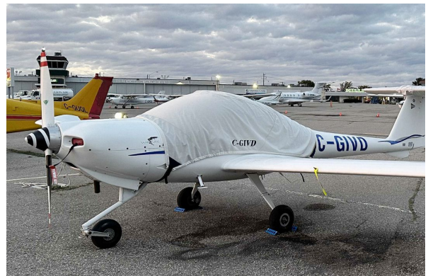
Diamond DA-20 Canopy Cover