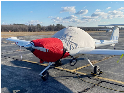
Diamond DA20-C1 Insulated Engine Cover, C1 models

This cover type is made from Silver Acrylic Sunbrella canvas and is 100% lined with a soft and smooth microfiber. Bruce's Custom Covers developed this material combination especially for aircraft protection. The outer material is medium weight and treated for water resistance, UV resistance and anti-static buildup. The inner lining is a very soft and smooth microfiber to prevent scratching. The material is very reflective, and tests show that the cabin interior temperature can be reduced to near-ambient temperature on the hottest of days. It is water, ice and snow repellent, yet breathable to allow moisture to escape from between the cover and the aircraft surface.