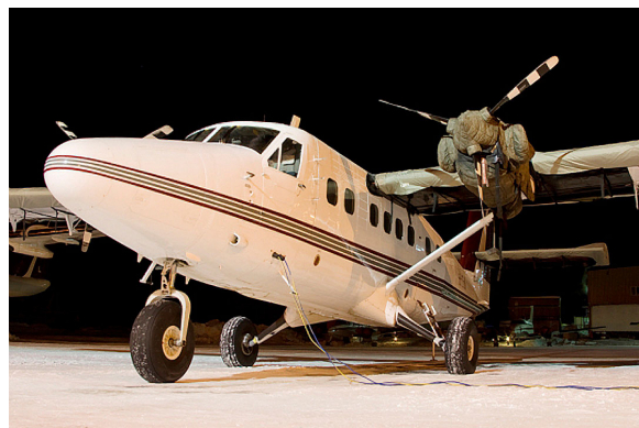
De Havilland Twin Otter Insulated Engine & Insulated Propellor/Spinner Covers Twin Otter Wing, Horiz. Stab & Engine Covers