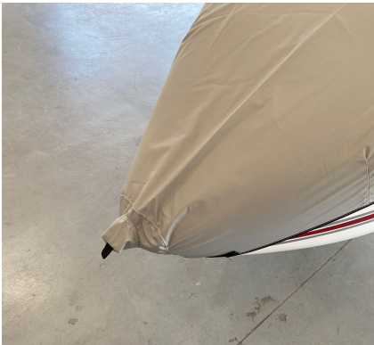
Cozy Mk IV Canopy/Nose/Engine Cover, travel weight design

Travel Covers are made with Silver Solution-Dyed Polyester fabric and only lined over the windshield to save weight. The material is lightweight and more compact for easy stowage in the aircraft. The polyester material is water resistant, but only intended for occasional use outside. We also have an ultra lightweight material available for fitted hangar dust covers. For daily outdoor use, the non-travel Sunbrella Cover is the best choice.