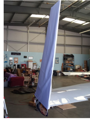
Velocity Vertical Stabilizer Covers, test fit cover