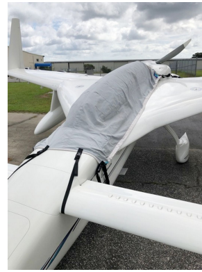
Cozy MkIV Canopy/Nose/Engine Cover, 3D model Cozy All Models Travel Cover, Light Weight Canopy Cover, Mark Iv Models