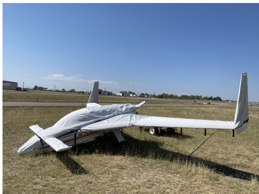
Cozy Mk IV Complete Cover Set

WINTER USE MATERIAL - Made with Solution-Dyed Polyester fabric, this option is intended for seasonal use to aid in deicing, rain mitigation, or for occasional travel. The material is lighter and more compact, but more susceptible to UV damage and may have a shorter useful life if used continuously outside than the all-year use material.