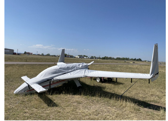
Cozy Mk IV Complete Cover Set