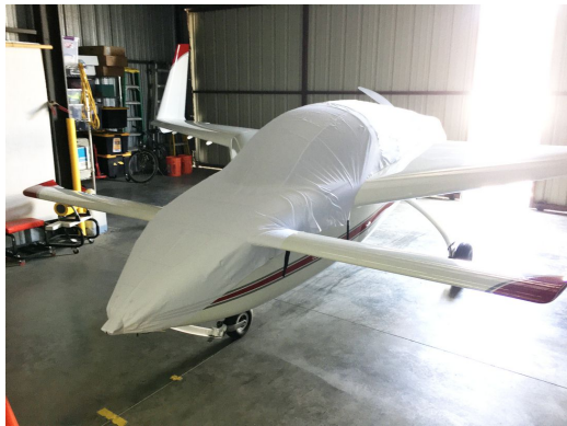
Cozy Canopy/Nose/Engine Cover, test fit cover

water resistance, UV resistance and anti-static buildup. The inner lining is a very soft and smooth microfiber to prevent scratching. The material is very reflective, and tests show that the cabin interior temperature can be reduced to near-ambient temperature on the hottest of days. It is water, ice and snow repellent, yet breathable to allow moisture to escape from between the cover and the aircraft surface.