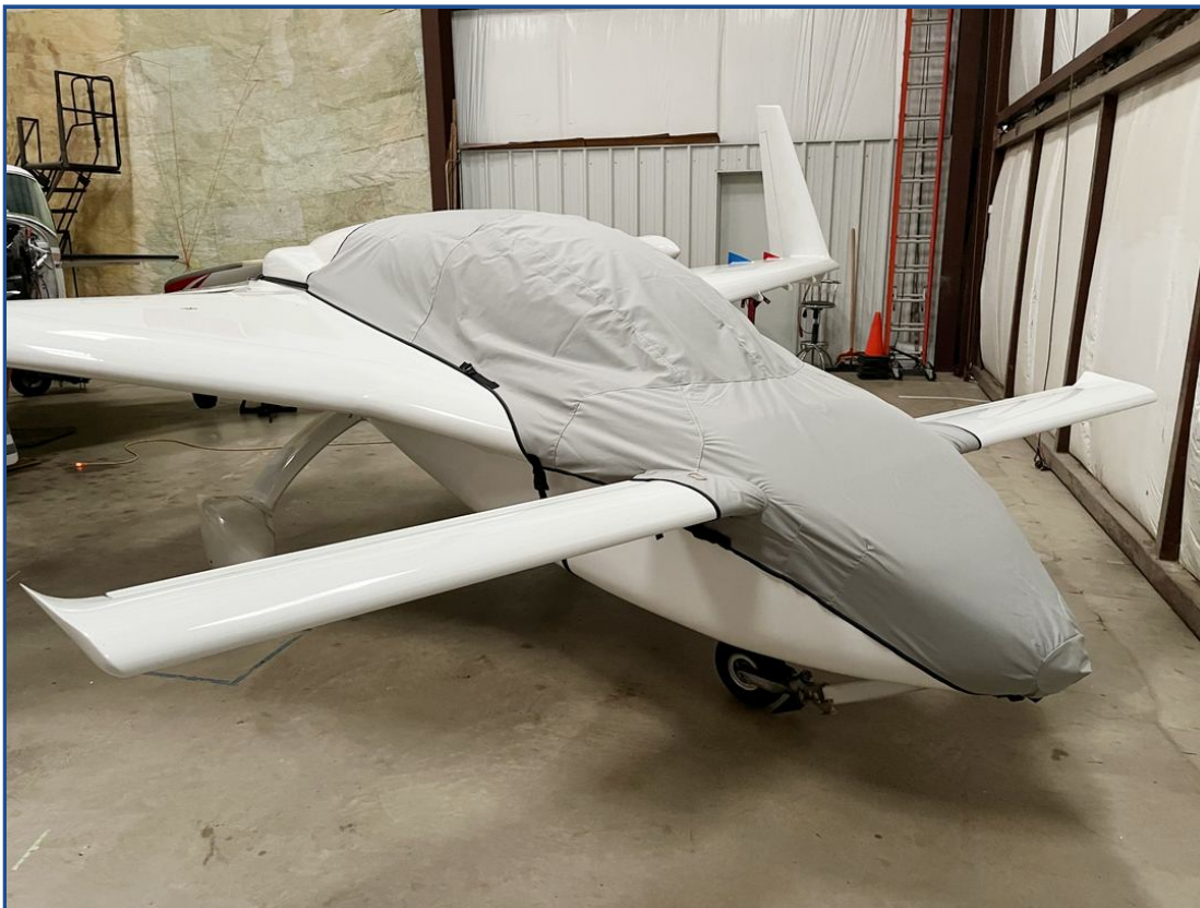
Cozy Mk IV Canopy/Nose Cover, travel weight