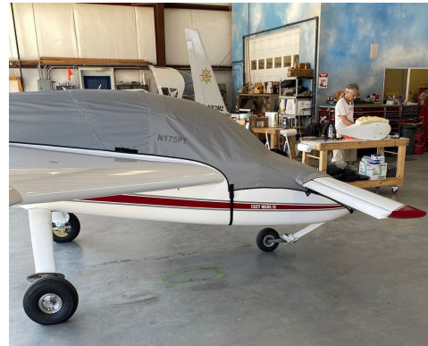
Cozy Mk IV Canopy/Nose/Engine Cover, travel weight design