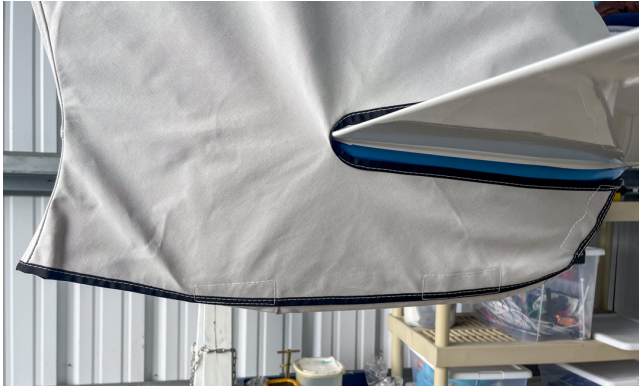
Cozy All Models Vertical Stabilizer Covers, All Year Use