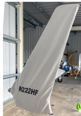
Cozy All Models Vertical Stabilizer Covers, All Year Use