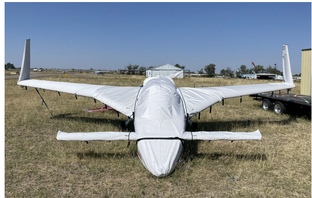
Cozy Mk IV Complete Cover Set