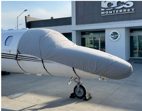
Cessna Citationjet 525B Travel Weight Cockpit/Nose Cover

This cover type is made from Silver Acrylic Sunbrella canvas and is 100% lined with a soft and smooth microfiber. Bruce's Custom Covers developed this material combination especially for aircraft protection. The outer material is medium weight and treated for water resistance, UV resistance and anti-static buildup. The inner lining is a very soft and smooth microfiber to prevent scratching. The material is very reflective, and tests show that the cabin interior temperature can be reduced to near-ambient temperature on the hottest of days. It is water, ice and snow repellent, yet breathable to allow moisture to escape from between the cover and the aircraft surface.