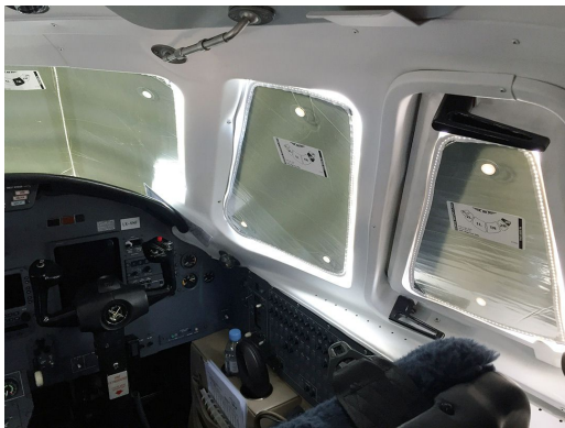
Cessna Citation XL, XLS (560XL) Cockpit Heatshields

Cockpit Heatshields are interior sunshades for the aircraft's cockpit. The product is a unique composite of closed-cell foam with a silver mylar finish. The semi-rigid design is stiff enough to stand inside the window framing. The set folds up flat and is easily stored in the included storage sleeve. Some designs may require velcro and suction cups. Our Heatshields for jets are offered white side out because some aircraft manufacturers have issued advisories against reflective window inserts due to potential heat damage. A Heatshield is an excellent short-term remedy for cockpit overheating, but an external fabric cover is more effective for long-term protection.