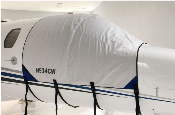
Cessna Citation M2 Cockpit Cover

This cover type is made from Silver Acrylic Sunbrella canvas and is 100% lined with a soft and smooth microfiber. Bruce's Custom Covers developed this material combination especially for aircraft protection. The outer material is medium weight and treated for water resistance, UV resistance and anti-static buildup. The inner lining is a very soft and smooth microfiber to prevent scratching. The material is very reflective, and tests show that the cabin interior temperature can be reduced to near-ambient temperature on the hottest of days. It is water, ice and snow repellent, yet breathable to allow moisture to escape from between the cover and the aircraft surface.