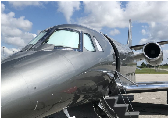
Cessna Citation 560XL Cockpit HeatShields