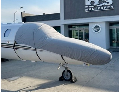
Cessna Citationjet 525B Travel Weight Cockpit/Nose Cover

This cover type is made from Silver Acrylic Sunbrella canvas and is 100% lined with a soft and smooth microfiber. Bruce's Custom Covers developed this material combination especially for aircraft protection. The outer material is medium weight and treated for water resistance, UV resistance and anti-static buildup. The inner lining is a very soft and smooth microfiber to prevent scratching. The material is very reflective, and tests show that the cabin interior temperature can be reduced to near-ambient temperature on the hottest of days. It is water, ice and snow repellent, yet breathable to allow moisture to escape from between the cover and the aircraft surface.