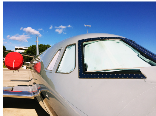
Cessna Citation XL, XLS (560XL) Cockpit Heatshields