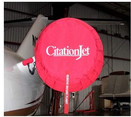
Cessna Citation Engine Cover Set