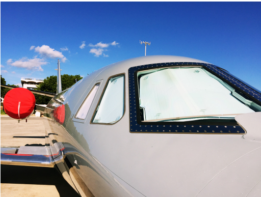
Cessna Citation XL, XLS (560XL) Cockpit Heatshields

Cockpit Heatshields are interior sunshades for the aircraft's cockpit. The product is a unique composite of closed-cell foam with a silver mylar finish. The semi-rigid design is stiff enough to stand inside the window framing. The set folds up flat and is easily stored in the included storage sleeve. Some designs may require velcro and suction cups. Our Heatshields for jets are offered white side out because some aircraft manufacturers have issued advisories against reflective window inserts due to potential heat damage. A Heatshield is an excellent short-term remedy for cockpit overheating, but an external fabric cover is more effective for long-term protection.