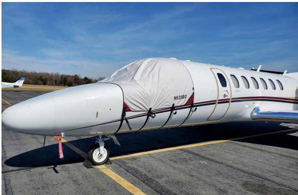
Cessna Citation 560 Cockpit Cover