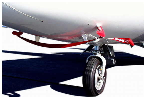
Cessna Citation I Pitot Covers