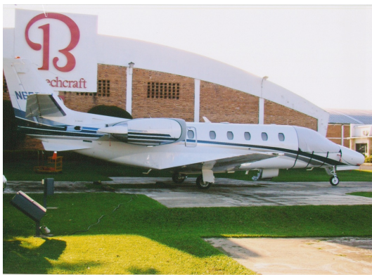
Citation XL Cockpit Cover & Bikini Type Engine Cover