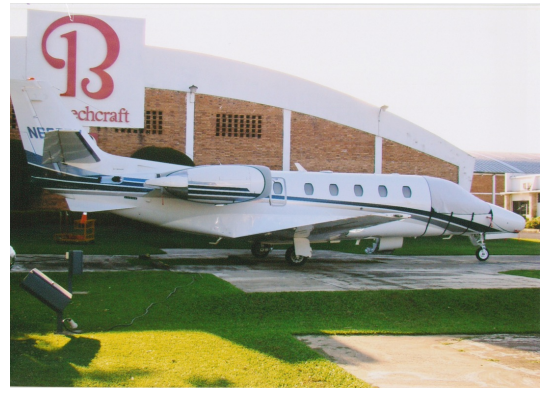
Citation XL Cockpit Cover & Bikini Type Engine Cover