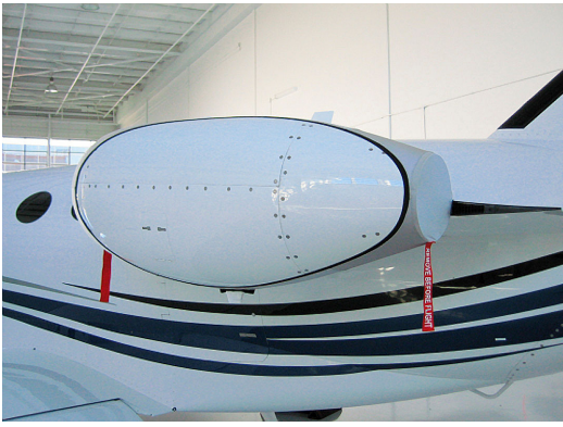
Cessna 510 Mustang Bikini Type Engine Cover