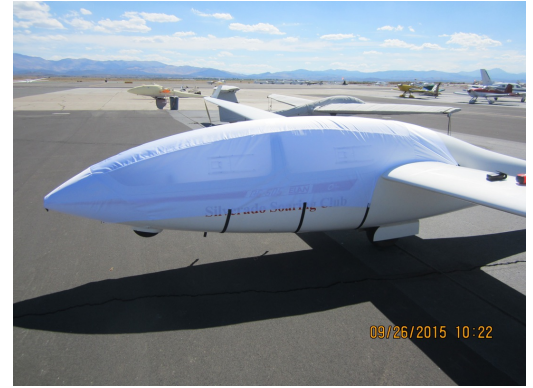
DG-505 Canopy/Nose Cover (test fit cover)