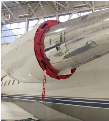
Canadair Challenger 604 Bypass Plugs

The Engine Inlet Plugs are custom fit for your Canadair Regional Jet 200, 700 intakes, made with heavy-duty vinyl material, and stuffed with a single block of sculpted urethane foam. Each plug has a zipper that allows the foam to be removed and dried if necessary. Engine plugs have 'remove before flight' streamers sewn onto the face of the plugs. Most plugs are imprinted with the aircraft registration number in black for an extra charge. Storage bag NOT included. Engine plugs may be inserted after flight when the engine is still warm. Engine Inlet Plugs are commonly referred to as Cowl Plugs, Intake Plugs, Cowl Blocks, Engine Blocks, and Engine Bung.