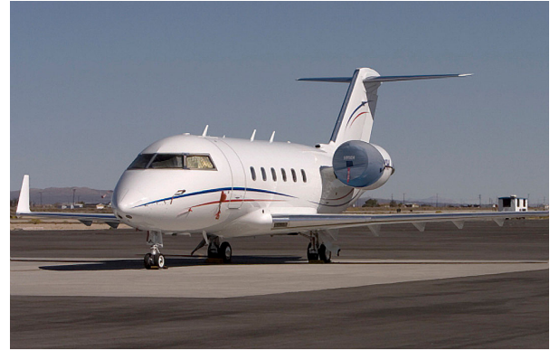
Challenger 604 Intake Covers, standard design