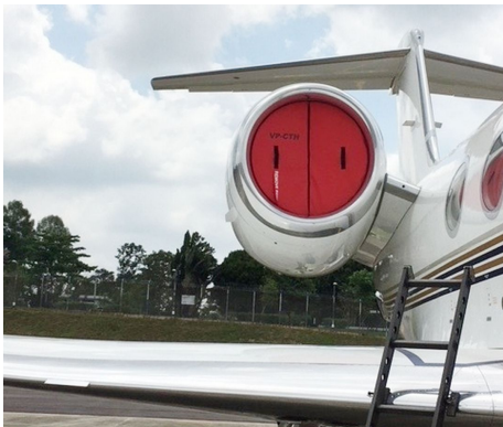
Grumman Gulfstream G450 Intake Plugs