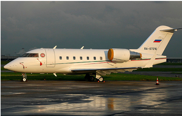
Challenger 604 Intake Covers, OEM design