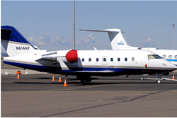
Challenger 604 Intake Covers, standard design

The Canadair Regional Jet 200, 700 Bikini Style Engine Covers are a single-piece design using a soft and smooth stretchy and fabric. The cover stretches tightly over both the intake and exhaust, installing quickly and easily. These covers are designed to be used as hangar dust covers and have a useful life of approximately one year.