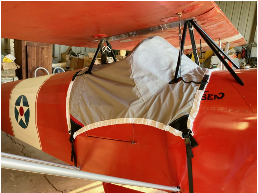
Corben Junior Ace Travel Weight Canopy Cover