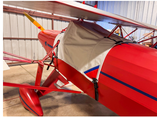
Corben Baby Ace, Junior Ace, and similar models Cockpit Cover Corben Baby Ace, Junior Ace, and similar models Cockpit Cover