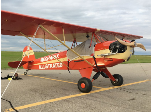
Corben Baby Ace Cockpit Cover

This cover type is made from Silver Acrylic Sunbrella canvas and is 100% lined with a soft and smooth microfiber. Bruce's Custom Covers developed this material combination especially for aircraft protection. The outer material is medium weight and treated for water resistance, UV resistance and anti-static buildup. The inner lining is a very soft and smooth microfiber to prevent scratching. The material is very reflective, and tests show that the cabin interior temperature can be reduced to near-ambient temperature on the hottest of days. It is water, ice and snow repellent, yet breathable to allow moisture to escape from between the cover and the aircraft surface.