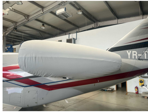
Citationjet 525C, CJ4, Complete Nacelle Cover, light weight Spandex