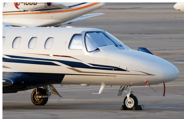
Cessna Citationjet 525, CJ-I, CJ1+, & M2 Cockpit Heatshields