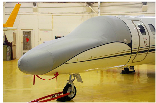
Citationjet CJ3 Cockpit/Nose Travel Cover