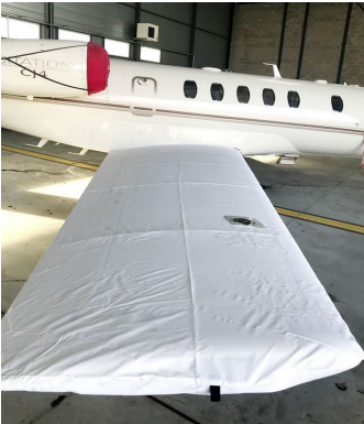
Cessna Citation CJ-4 Wing Covers, test fit cover

WINTER USE MATERIAL - Made with Solution-Dyed Polyester fabric, this option is intended for seasonal use to aid in deicing, rain mitigation, or for occasional travel. The material is lighter and more compact, but more susceptible to UV damage and may have a shorter useful life if used continuously outside than the all-year use material.