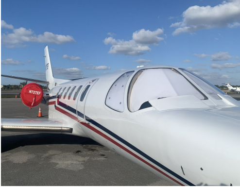
Cessna Citation S550

Custom-made Heatshield Sunshades are available for almost any window in the jet. Side windows, Skylights, and Emergency Exits are all custom-made. The product is a unique composite of closed-cell foam with a silver mylar finish. The set is easily stored in the included storage sleeve. Some designs may require velcro and suction cups. Our Heatshields are offered white side out since aircraft manufacturers have issued advisories against reflective window inserts due to potential heat damage.