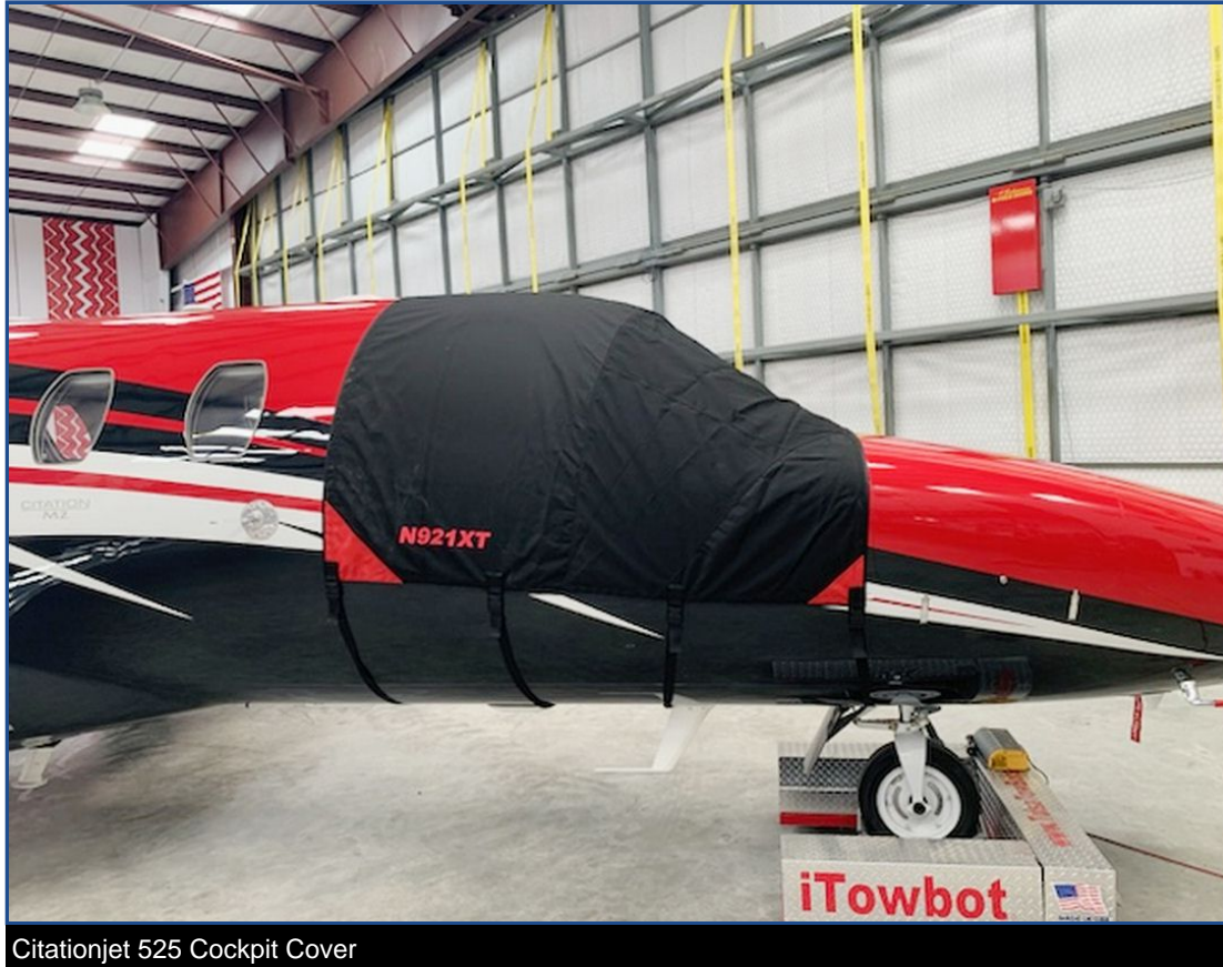
Citationjet 525 Cockpit Cover