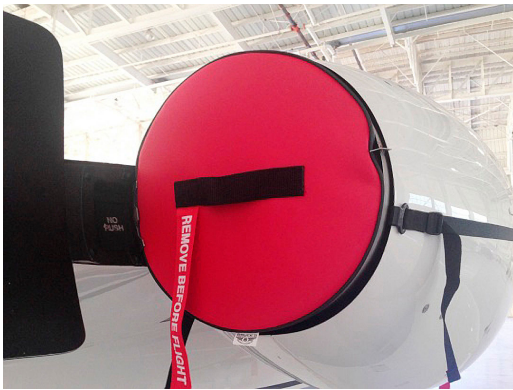
Cessna CJ1 Exhaust Plug

The Cessna Citationjet 525B, CJ-3 Intake/Exhaust Plugs are custom fit for the intake and exhaust openings, made with heavy-duty vinyl material, and stuffed with a single block of sculpted urethane foam. Each plug has a zipper that allows the foam to be removed and dried if necessary. Engine plugs have 'remove before flight' streamers sewn onto the face of the plugs. Most plugs are imprinted with the aircraft registration number in black. Engine plugs may be inserted after flight when the engine is still warm. Engine Inlet Plugs are commonly referred to as Cowl Plugs, Intake Plugs, Cowl Blocks, Engine Blocks, and Engine Bungs.