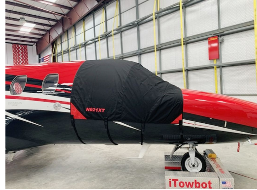
Citationjet 525 Cockpit Cover