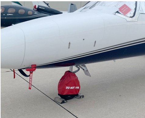
Cessna Citation Nose Tire Cover

ALL-YEAR USE MATERIAL - Made with Silver Acrylic Sunbrella canvas, the all-year use material is the best option for sun protection and cover longevity. This heavier more durable material is intended for all weather conditions, such as rain and snow or lots of sun.