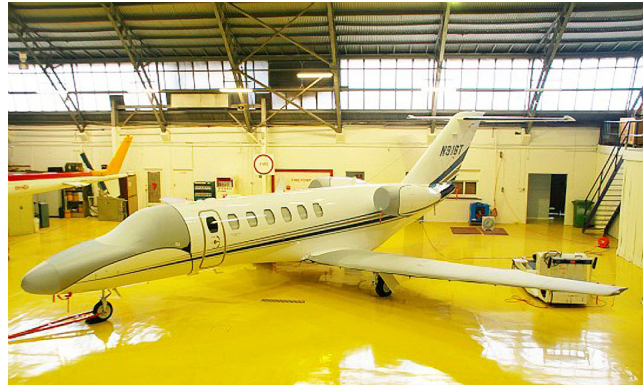
Cessna Citationjet CJ3 Cockpit/Nose, Engine & Wings Travel Covers