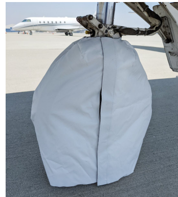
CJ1 Nose Gear Tire Cover, test fit