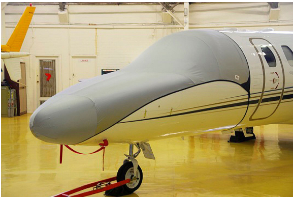
Citationjet CJ3 Cockpit/Nose Travel Cover

This cover type is made from Silver Acrylic Sunbrella canvas and is 100% lined with a soft and smooth microfiber. Bruce's Custom Covers developed this material combination especially for aircraft protection. The outer material is medium weight and treated for water resistance, UV resistance and anti-static buildup. The inner lining is a very soft and smooth microfiber to prevent scratching. The material is very reflective, and tests show that the cabin interior temperature can be reduced to near-ambient temperature on the hottest of days. It is water, ice and snow repellent, yet breathable to allow moisture to escape from between the cover and the aircraft surface.