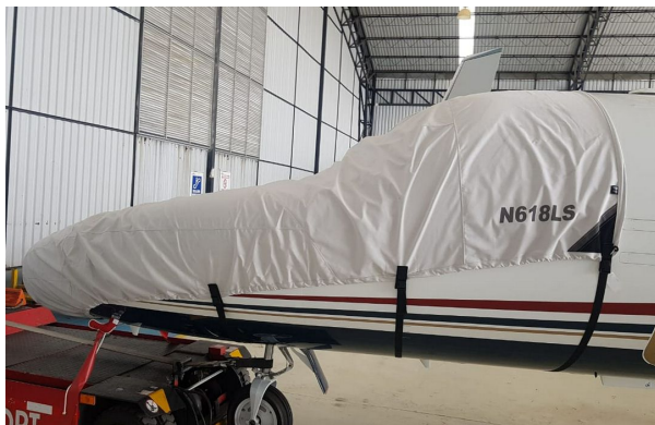
Citationjet 525B Cockpit/Nose Cover

This cover type is made from Silver Acrylic Sunbrella canvas and is 100% lined with a soft and smooth microfiber. Bruce's Custom Covers developed this material combination especially for aircraft protection. The outer material is medium weight and treated for water resistance, UV resistance and anti-static buildup. The inner lining is a very soft and smooth microfiber to prevent scratching. The material is very reflective, and tests show that the cabin interior temperature can be reduced to near-ambient temperature on the hottest of days. It is water, ice and snow repellent, yet breathable to allow moisture to escape from between the cover and the aircraft surface.