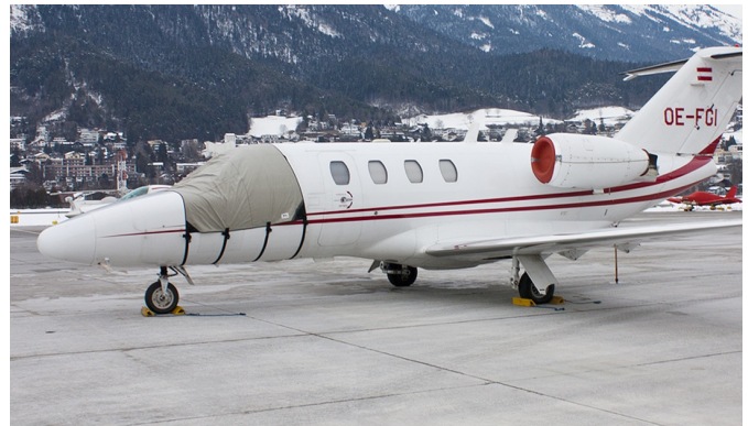
Cessna Citationjet CJ1 Cockpit Cover