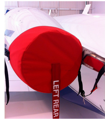
Citation CJ3 Exhaust Cover