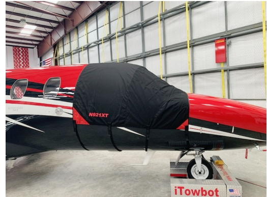
Citationjet 525 Cockpit Cover