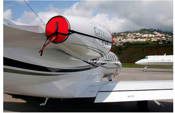
Citation CJ3 Exhaust Plug