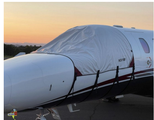
Cessna Citation Jet 525 Cockpit Cover