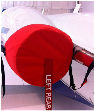
Citation CJ3 Exhaust Cover

The Cessna Citationjet 525B, CJ-3 Intake/Exhaust Plugs are custom fit for the intake and exhaust openings, made with heavy-duty vinyl material, and stuffed with a single block of sculpted urethane foam. Each plug has a zipper that allows the foam to be removed and dried if necessary. Engine plugs have 'remove before flight' streamers sewn onto the face of the plugs. Most plugs are imprinted with the aircraft registration number in black. Engine plugs may be inserted after flight when the engine is still warm. Engine Inlet Plugs are commonly referred to as Cowl Plugs, Intake Plugs, Cowl Blocks, Engine Blocks, and Engine Bungs.