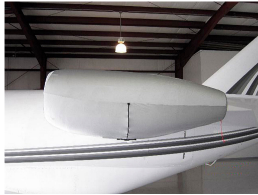
Citation CJ3 Bikini Style Engine Cover Set, full nacelle enclosure