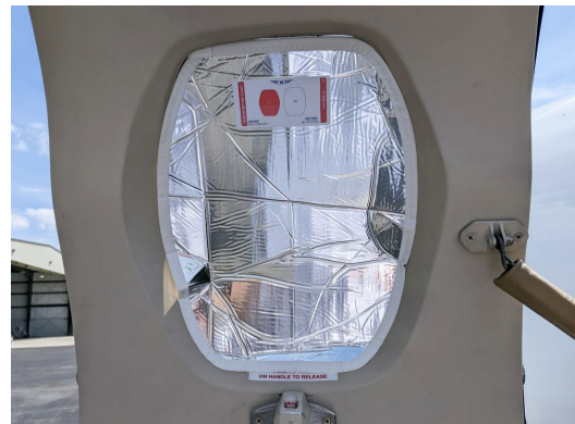
Citationjet Entrance Door Heatshield