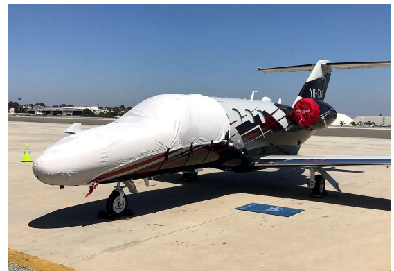
Citationjet CJ1 Cockpit/Nose Cover