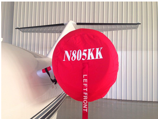
Cessna CJ1 Intake Cover and Inlet Plug

The Cessna Citationjet 525A, CJ-2, & CJ2+ Intake/Exhaust Plugs are custom fit for the intake and exhaust openings, made with heavy-duty vinyl material, and stuffed with a single block of sculpted urethane foam. Each plug has a zipper that allows the foam to be removed and dried if necessary. Engine plugs have 'remove before flight' streamers sewn onto the face of the plugs. Most plugs are imprinted with the aircraft registration number in black. Engine plugs may be inserted after flight when the engine is still warm. Engine Inlet Plugs are commonly referred to as Cowl Plugs, Intake Plugs, Cowl Blocks, Engine Blocks, and Engine Bungs.