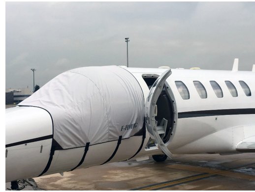
Cessna Citationjet Cockpit Cover, Convenient entry door access