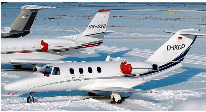
Engine Inlet Covers