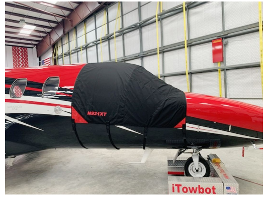
Citationjet 525 Cockpit Cover