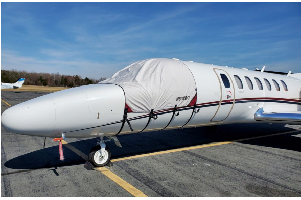
Cessna Citation 560 Cockpit Cover