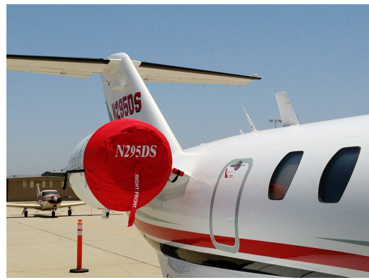
Inlet Covers & Exhaust Plugs