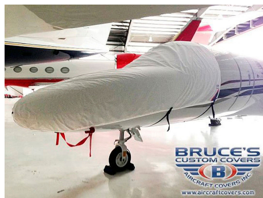
Cessna Citationjet 525B Travel Weight Cockpit/Nose Cover Citation CJ4 Cockpit/Nose Cover and Heat Resistant Pitot Covers set