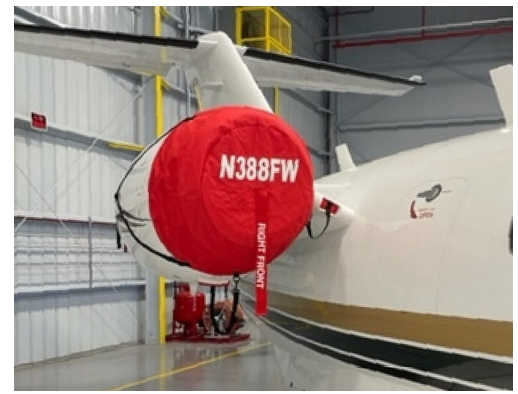
Cessna Citationjet 525 Intake Cover with Plugs