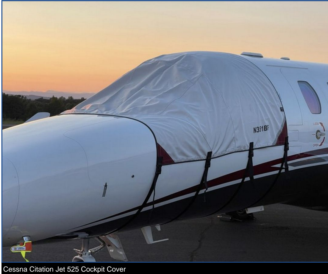
Cessna Citation Jet 525 Cockpit Cover