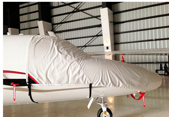
Citation CJ4 Cockpit/Nose Cover and Heat Resistant Pitot Covers set