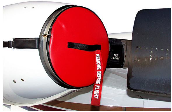
Engine Exhaust Plug