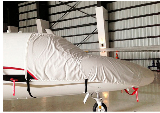
Citation CJ4 Cockpit/Nose Cover and Heat Resistant Pitot Covers set