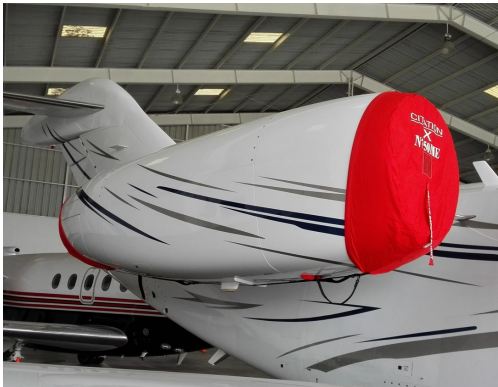
Citation X Intake/Exhaust Cover Set

The Cessna Citation X (750) Intake Covers are designed to install easily yet be completely storable. A spring steel hoop is sewn into the hem of each cover, allowing them to be installed without climbing onto the wing or using a stepladder. To store the covers the spring steel hoop folds like a band-saw blade into three nesting rings. Each cover folds into a compact circular bundle which is stored in the included duffle bag, yet they unfold quickly for use. The Tri-Fold Ring cover is made of medium weight nylon which is available in a variety of colors to match the paint trim. Each cover set comes complete with installation and folding instructions. The aircraft's registration number can be silkscreened onto the cover for an extra charge.