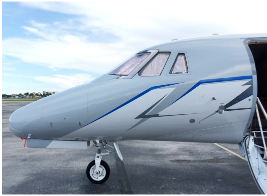
Cessna Citation 650 Cockpit HeataShields